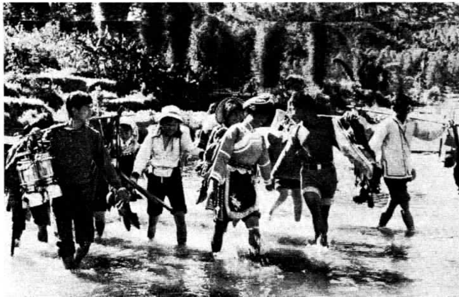
Members of the Song and Dance Troupe of the Lahu Autonomous County in Yunnan Province on their way to give a rural performance.

Thirty-six peasants in Xinhui County, Guangdong Province, set up a poets' society in 1981. The members of the society get together every weekend, bringing their new works, to discuss and improve their poems. The society also corresponds with eminent poets and literary societies in Shanghai, Tianjin and Guangdong.