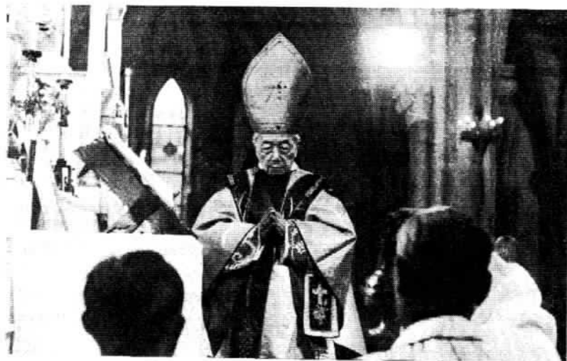
Bishop Zhang Jiashu leading Mass.

their own bishops. In 1980, the National Administrative Commission of the Chinese Catholic Church and the Chinese Episcopacy were also established, to strengthen the organization and leadership of the Catholic church in China.