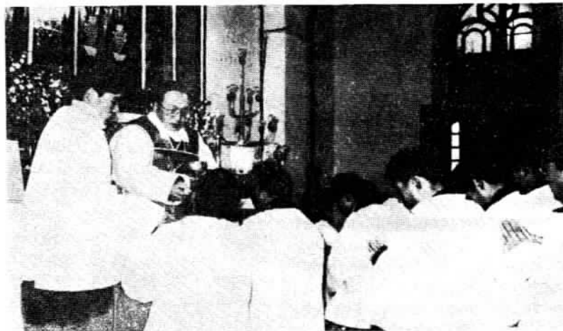
Director Jin Luxian baptizes Catholics during Mass.

In 1957, the China Patriotic Catholic Association was established. It freed China's Catholics from the Vatican's control, and charted the course for an independent operation of the Catholic church in China. Since then parishes throughout the country have been electing and consecrating