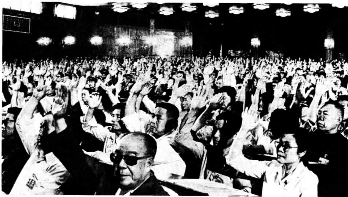
The resolutions are voted by a show of hands.