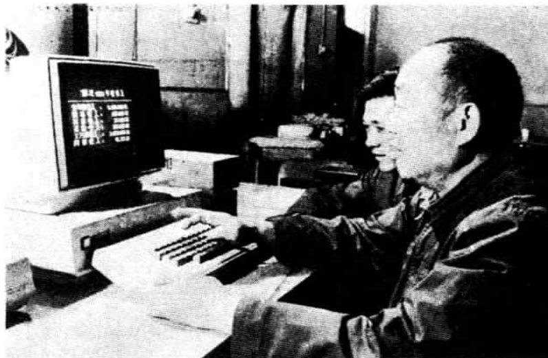
Peasants in Liuzhuang village using a microcomputer.

dition to collecting information at the county and commune levels, these enterprises send people to other parts of the country to collect economic information, which helps them to decide what goods to produce and how to market them.