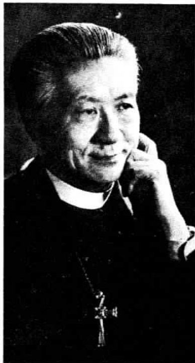
Bishop K.H. Ting.

Answer: There are some three million Protestants in China. You can find them in almost all parts of the country, with a preponderance in provinces along the sea coast. During the "cultural revolution" ultra-Left extremists closed down all our churches. With the restoration of religious freedom in recent years, at least 1,600 churches have been reopened or built so far. Then there are many groups of Christians who worship in meeting places of one kind or another. In addition to the several thousand ordained ministers there are a large number of lay leaders serving these churches and groups. The Protestants in China are united under the China Christian Council