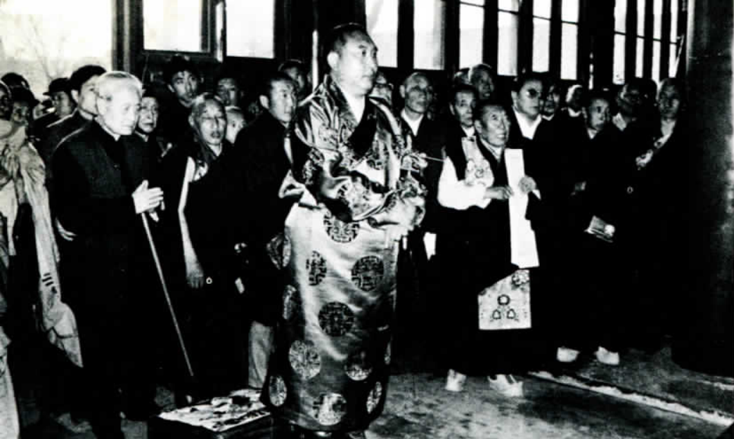
The China Buddhist Association celebrates its 30th anniversary at Beijing's Guangji Temple.