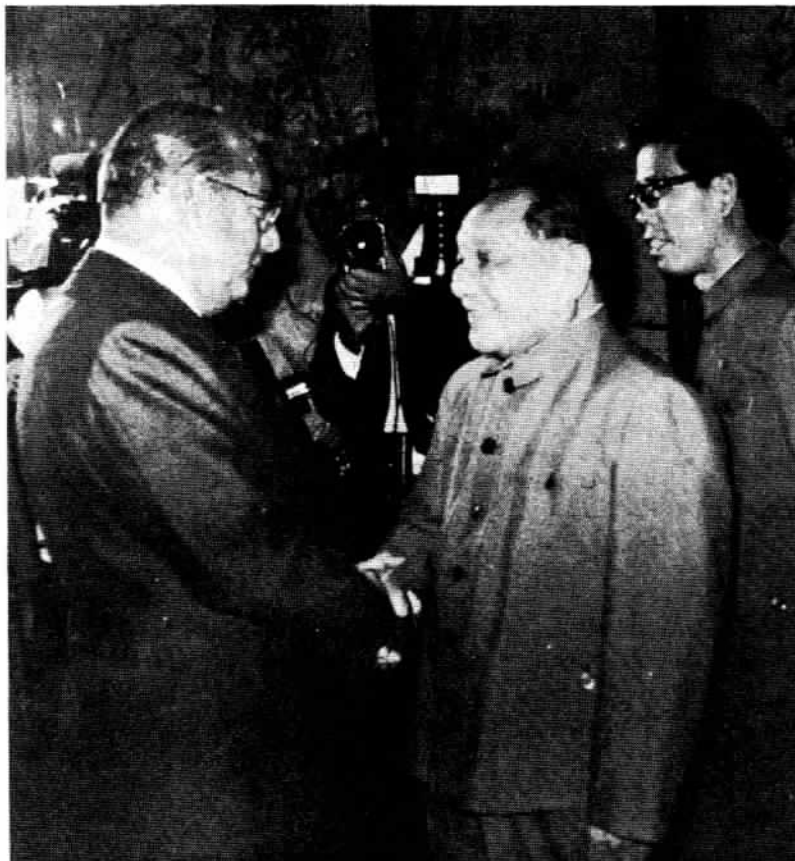
Chairman Deng Xiaoping meets with Brazil's President Jao Baptista De Oliveira Figueiredo.

obstacles to the rehabilitation and development of the world economy, and must be resolved.