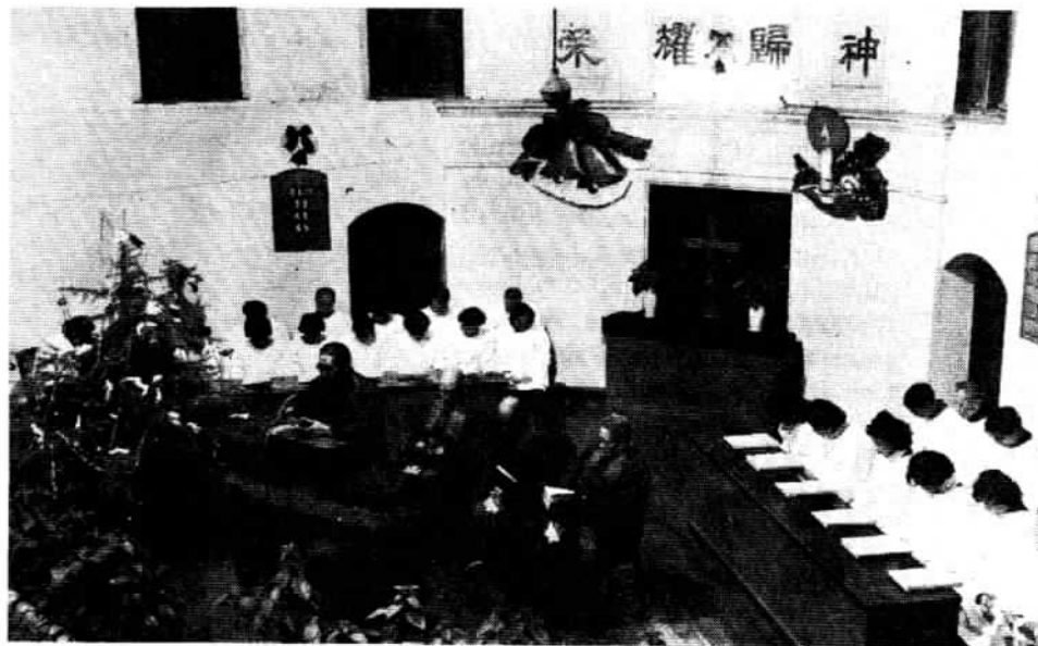
Celebrating Christmas Mass at a Protestant church in Shanghai.