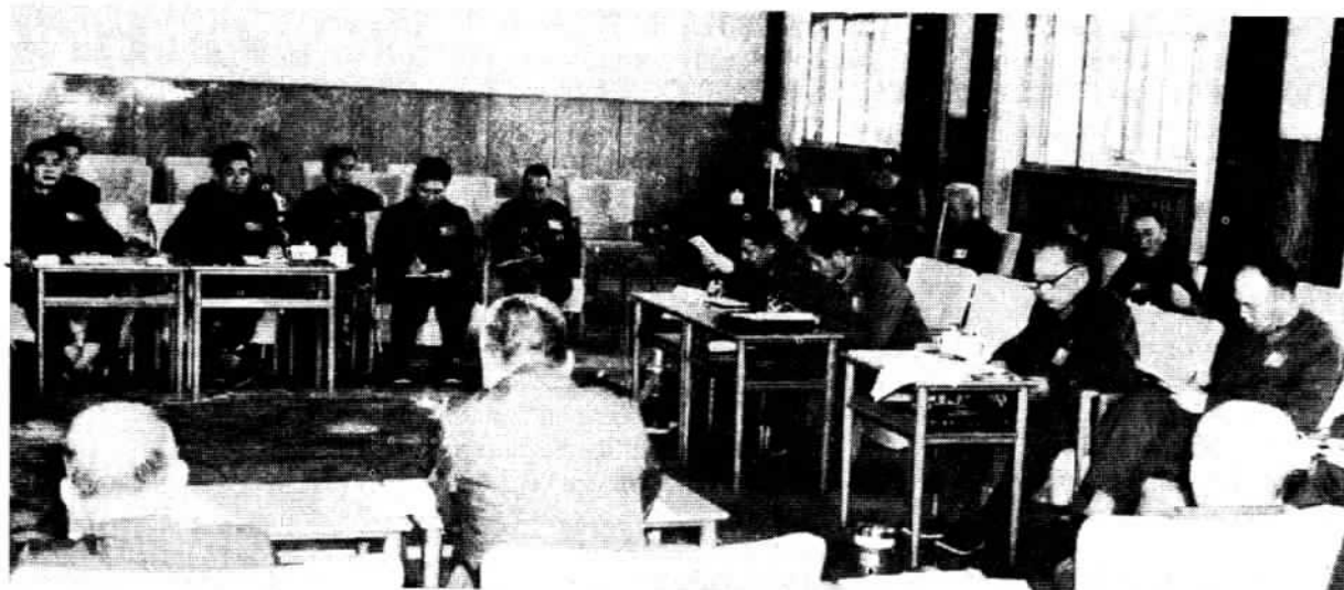
NPC deputies from the PLA discuss "The Draft Conscription Law of the People's Republic of China."

The conscription law sets the term of service at three years for the army and four years for the air force and the navy. After completion, a soldier may stay for another term if needed by the army, and if he is willing. The extra service terms are one to two years for the army and one year for the air force and the navy. A person under compulsory service who has completed a term of five years and has thus acquired specialized skills, may switch to voluntary service after his application is approved by the authorities at or above the divisional level. The voluntary service term, 8-12 years, is counted from the day he switches to voluntary service. A voluntary soldier may not be older than 35.