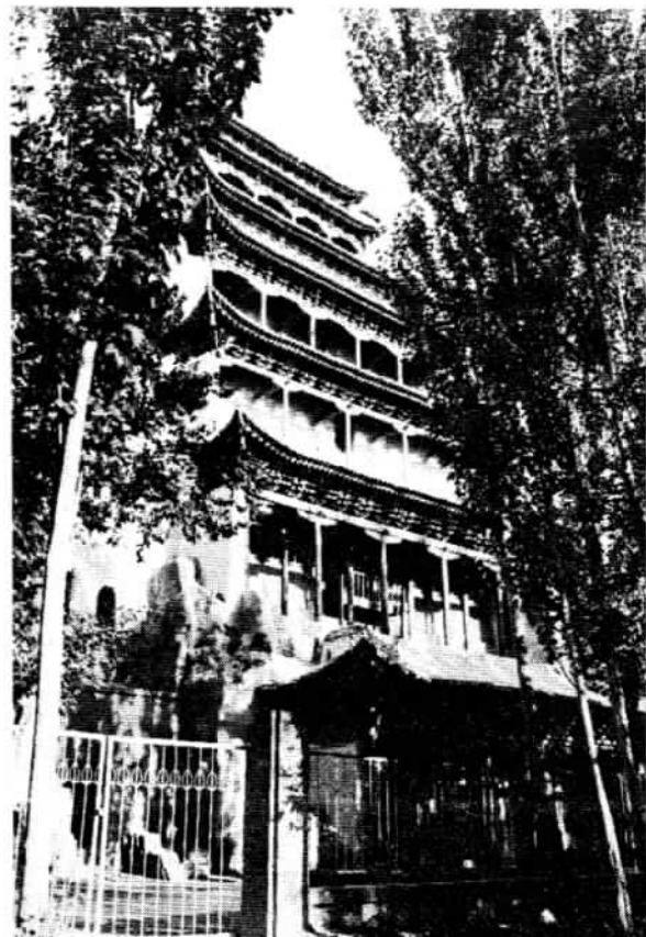
Left: Outside the Dunhuang Grottoes. Right: Buddhas in Mogao Cave No. 45 made in the Tang Dynasty (618-907).