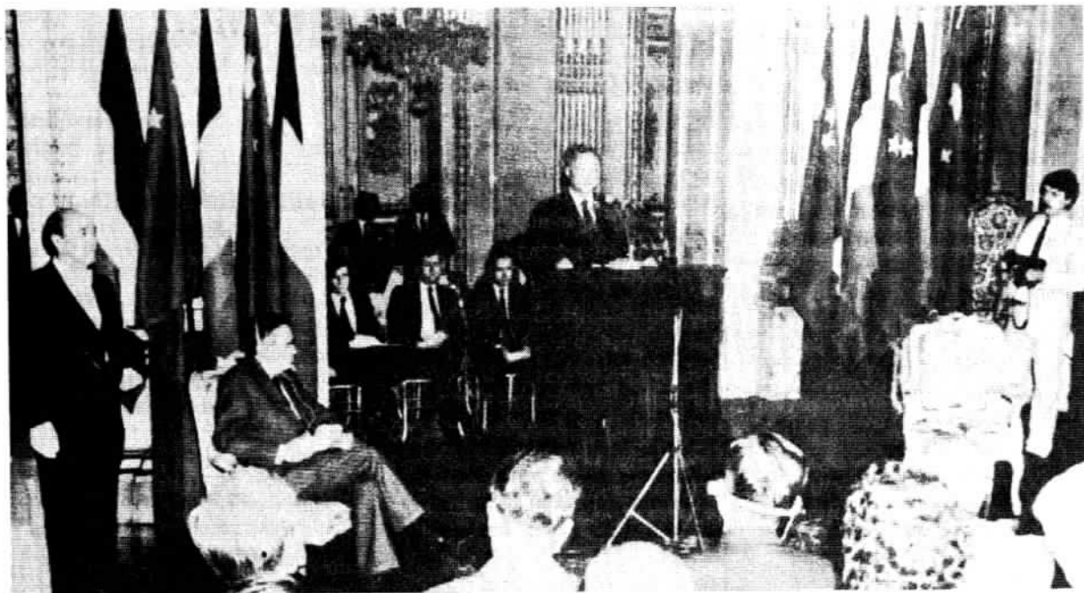
Premier Zhao Ziyang speaks before the French National Assembly.