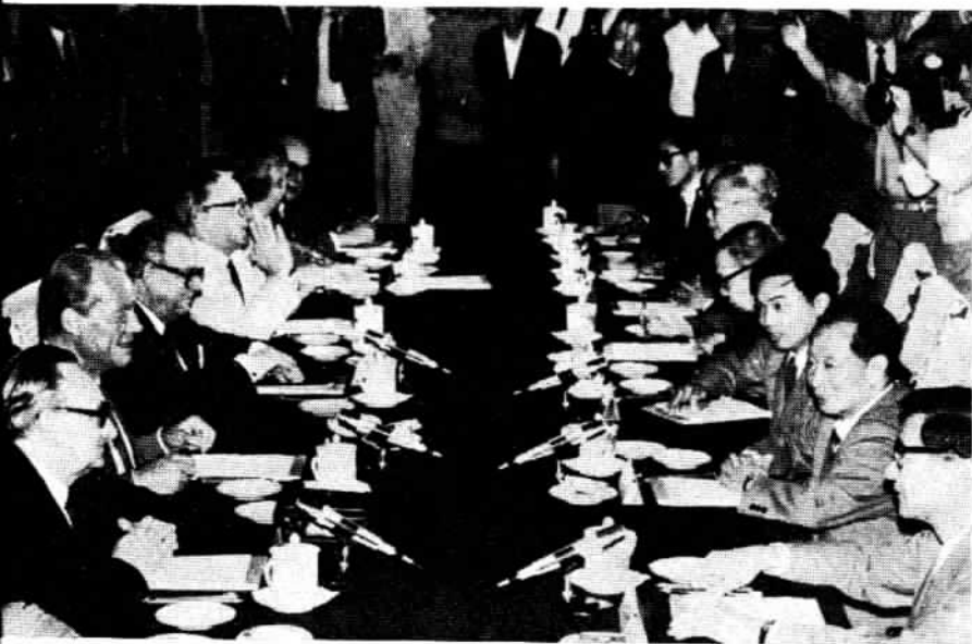
General Secretary Hu Yaobang (second from right) hold talks with SDP Chairman Willy Brandt (second from left).

does not intend to strain its relations with the superpowers, he said. It still hopes that the strained relations between the superpowers could be eased, he said, because an intensified superpower rivalry would bring disaster both to the people of their own countries as well as to the peoples.