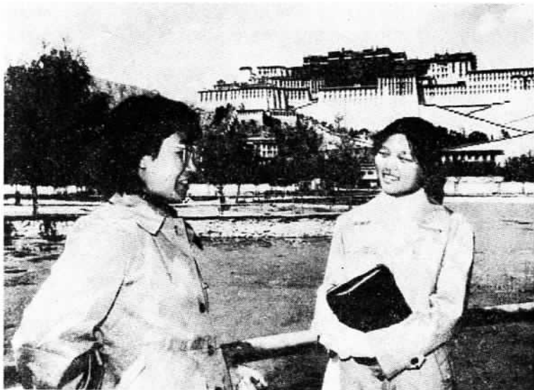
Two university graduates who volunteered to work in Tibet arrive in Lhasa earlier this year.

What causes worry is the fact while few scientific and technical workers are willing to go to these regions, quite many are leaving and the rate seems to be increasing. Undeniably, this exodus can be attributed to the many difficulties which confront scientists and technicians working in these outlying areas. Their relatively backward economies make for a harsh life. Education, which intellectuals consider so vital for their children, is underdeveloped. And they have no place to