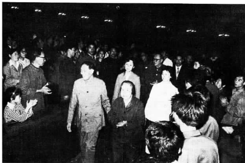
Deng Yingchao and other Party and state leaders at the National Day (October 1) get-together.

The actions taken to deal swift and heavy blows against criminals has won the warm support of the people throughout the country.