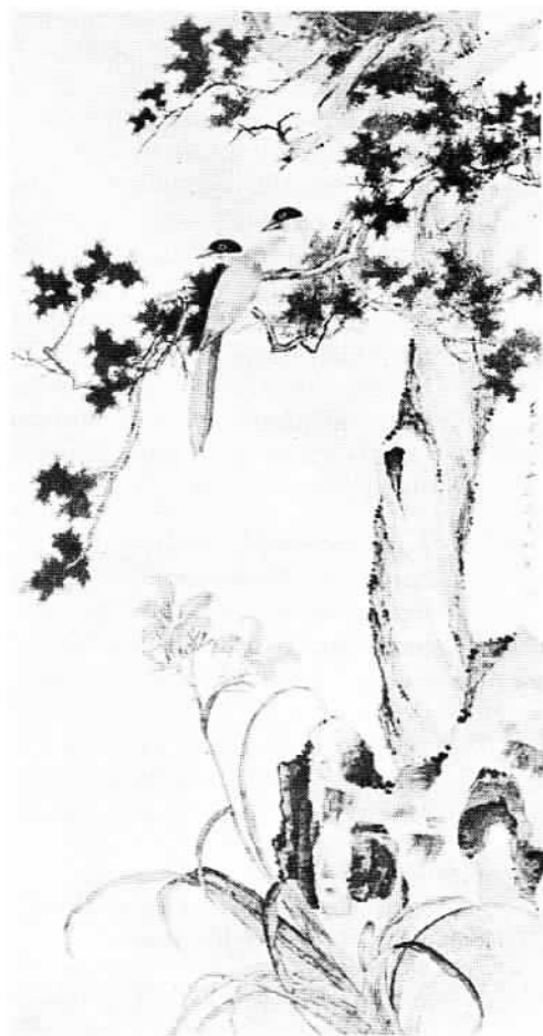
"Magpies and the Cypress."

In recent years, Mogu paintings have become increasingly rare because the technique is difficult for beginners to learn. The aim of this exhibition is to revive this school of painting and encourage painters to develop many different styles.