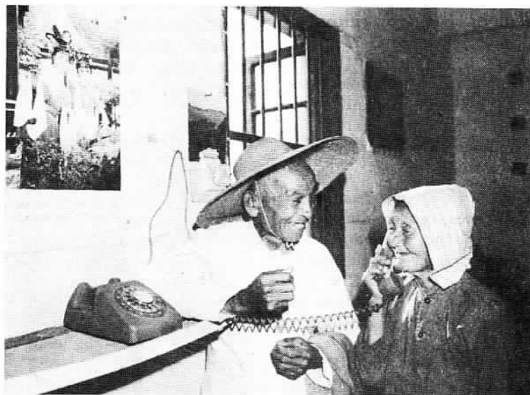
"Hello..." An old couple in Shanghai's Baoshan County enjoy a chat on their new telephone.

— "Zhongguo Qingnian Bao" (China Youth News)