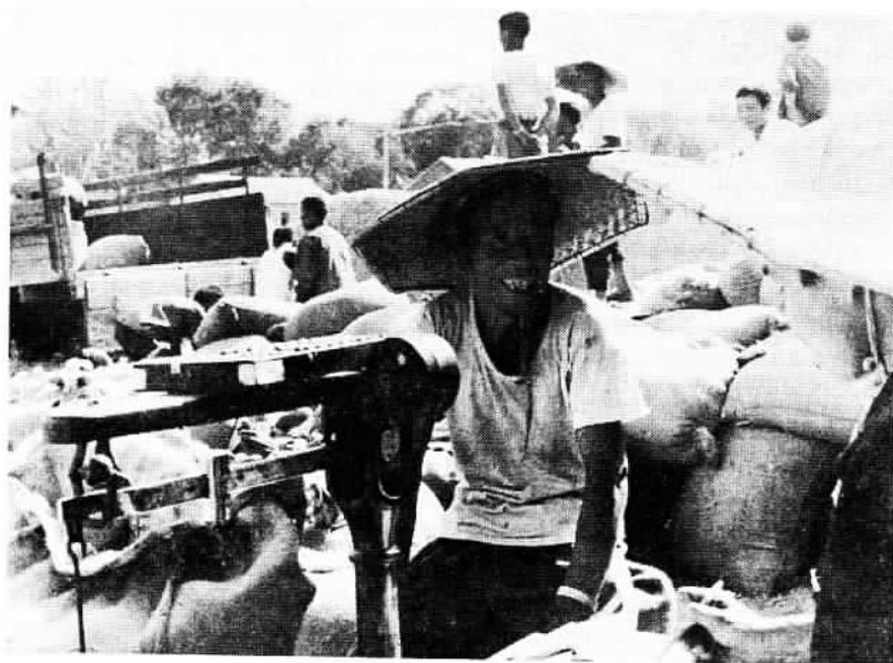
Peasants in Zouxian County of Shandong Province enthusiastically sell wheat to the state after harvest.

In order to meet the country's need for energy, in recent years the state has readjusted the geographical distribution of its coal production to speed up the