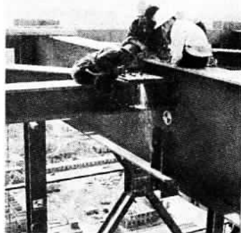
The Yuanbaoshan Power Plant in Inner Mongolia is under construction.

Full text of the Reg- ulations for the Imple- mentation of the Law of the People's Republic of China on Joint Ventures Using Chinese and Foreign Investment (supplement).