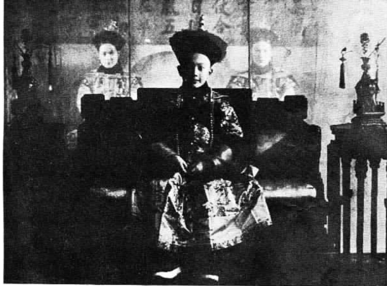
A scene from "Reign Behind the Curtain": the six-year-old emperor with his regent (left) behind the silk curtain.

The cast is as impressive as the props. The role of Emperor Xian Feng is played by Liang Jiahui from Xianggang. He was chosen because he resembles the emperor both in appearance and manner. Liu Xiaoqing, from the mainland, played opposite Liang as Cixi. With experience in 13 films behind her, she has become very popular at home for her versatile playing and characterization. The favourite courtier of Emperor Xian Feng, Su Shun, was played by Xiang Kun, also from the mainland. Though already in his seventies, he played his part vividly, as is typical of his skill.