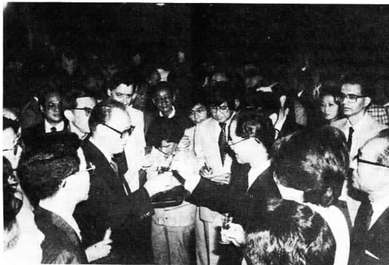
Premier Zhao Ziyang with guests from various countries at the National Day reception.

Industrial production has been growing steadily as a result of