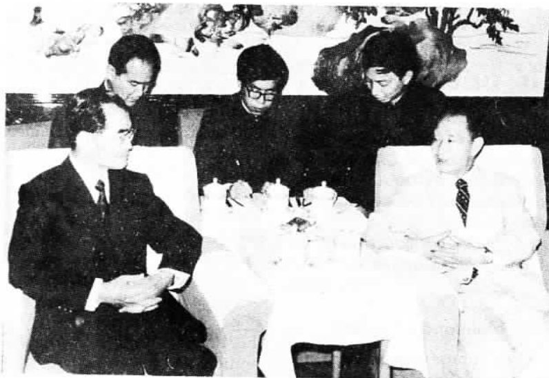
Hu Yaobang meets with Masashi Ishibashi and the Japanese Socialist Party Delegation he led.

Qiao said he hoped to see continuous development of Sino-Japanese relations in various fields through the concerted efforts of the two peoples. General Secretary Hu Yaobang's scheduled visit to Japan in November will certainly advance the cause of Chinese and Japanese peoples living in friendship from generation to generation. China was very much concerned about the direction of Japan's development, Qiao added.