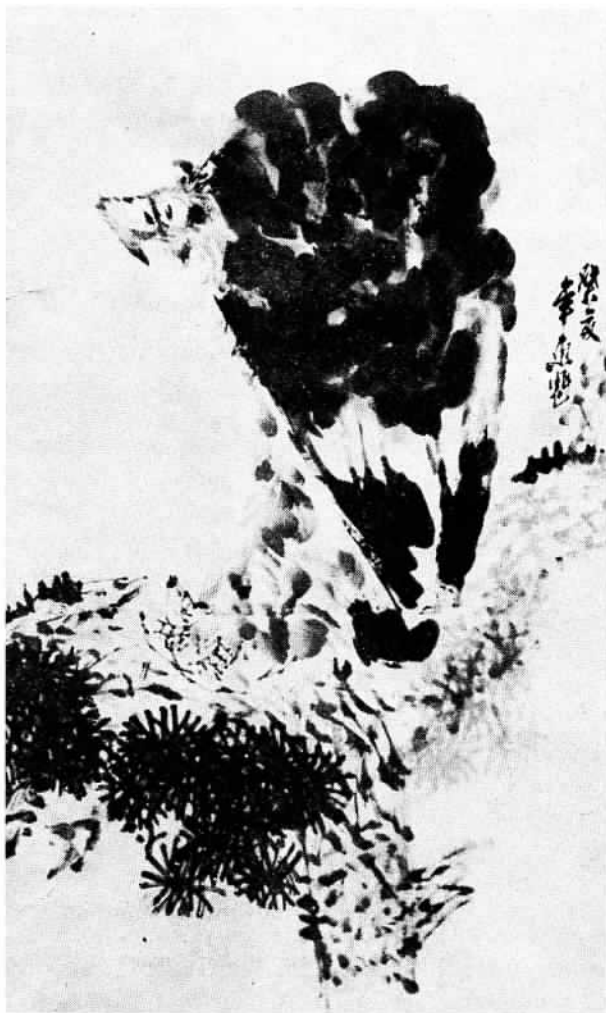
A Pine Tree and an Eagle.

His fresh style paintings, full of simplicity and grace, have been displayed in many cities and provinces.