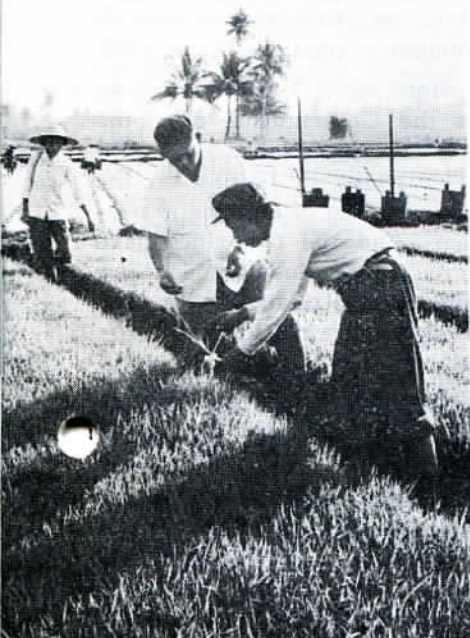
Agrotechnicians on Hainan Island helping local peasants grow rice seedlings.

tract basis, and not through issuing orders, benefits both the peasants and the technicians, as both parties to the contracts have their duties and obligations. If there is an increase in output, the production teams will have to pay a certain amount of remuneration to the agrotechnical departments, and if there is a crop failure resulting from technical reasons, the production teams will get compensations for the loss.