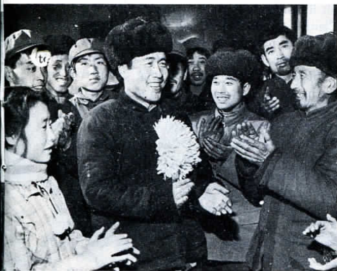
A production team leader in Liaoning Province is given a red paper flower upon his re-election. During his first term, his team enormously boosted its grain output.

Comrade Liu Shaoqi stated in his political report to the Eighth National Congress of the Chinese Communist Party in 1956: "Our people's democratic dictatorship at the present stage is in essence a form of the dictatorship of the proletariat." This is because the state power of the people's democratic dictatorship is led by the proletariat through its vanguard, the Chinese Communist Party, and it implements proletarian policies and shoulders the proletariat's