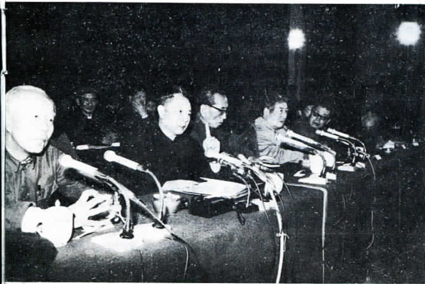
Hu Yaobang (second from left), General Secretary of the Central Committee of the C.P.C., and Wan Li (first from left), Member of the Secretariat and Vice-Premier, in Lhasa, May 1980.