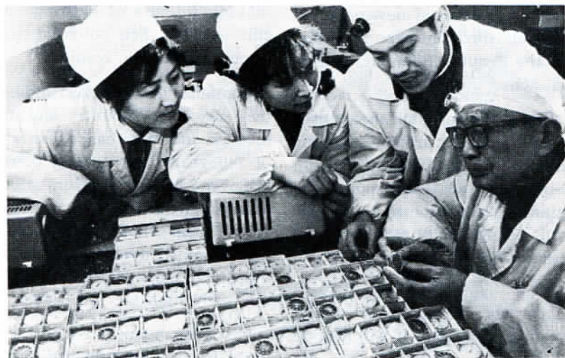
A Shanghai master watch-maker (seated) sharing his expertise with the young workers of Wuhan in central China.

Popularization of new results of scientific research on a con-