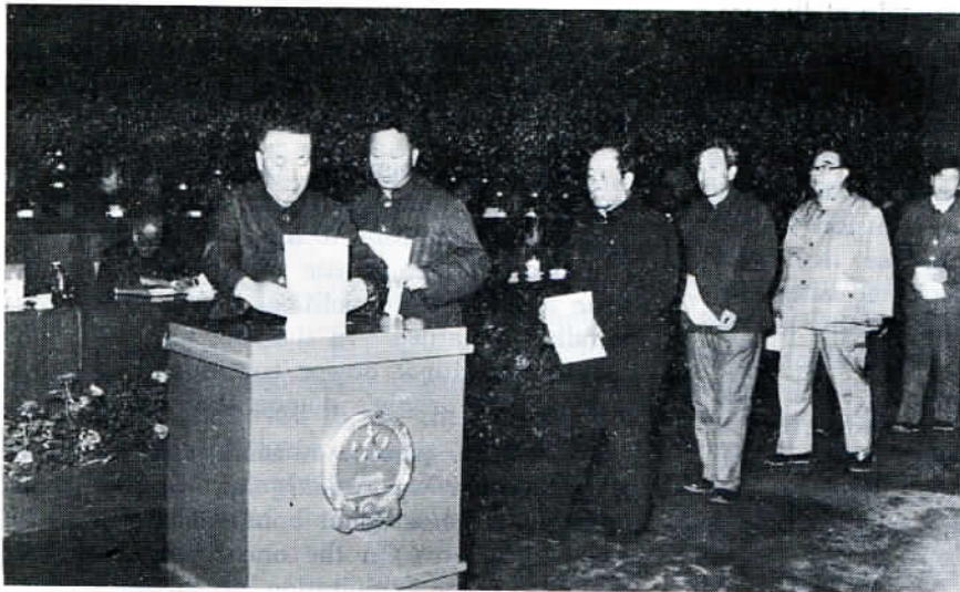
Beijing municipal people's deputies voting for their city's mayor.