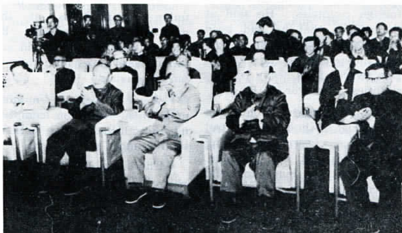
Chen Yun (3rd from the right), Vice-Chairman of the C.P.C. Central Committee, at a May Day celebration in Hangzhou.

Song Renqiong urged them to take an active part in the work of readjusting the national economy, help achieve the rationalization of the economic structure, the management system and enterprise organization, and blaze a road of so-