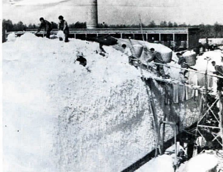
Rich cotton harvest in Nanyang County, Henan Province.

Output of aquatic products was 4,497,000 tons, 4.5 per cent over the previous year. Output of freshwater products increased by 11.1 per cent, and marine products, 2.1 per cent.