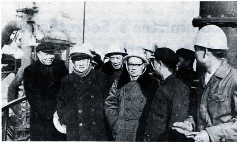
Member of the Secretariat Gu Mu (glasses) and Vice-Premier Bo Yibo (second from left) visiting the Shoudu Iron and Steel Works over the Spring Festival this year.

year, members of the Secretariat flew in helicopters over Beijing and its suburbs in connection with town planning and environmental problems. They literally "dropped in" unannounced on people. They saw for themselves the destructive march of sand dunes around the metropolis and the bell of smog over the industrial districts. This has led to greater efforts to fight pollution and the restoration of the Arbour Day.