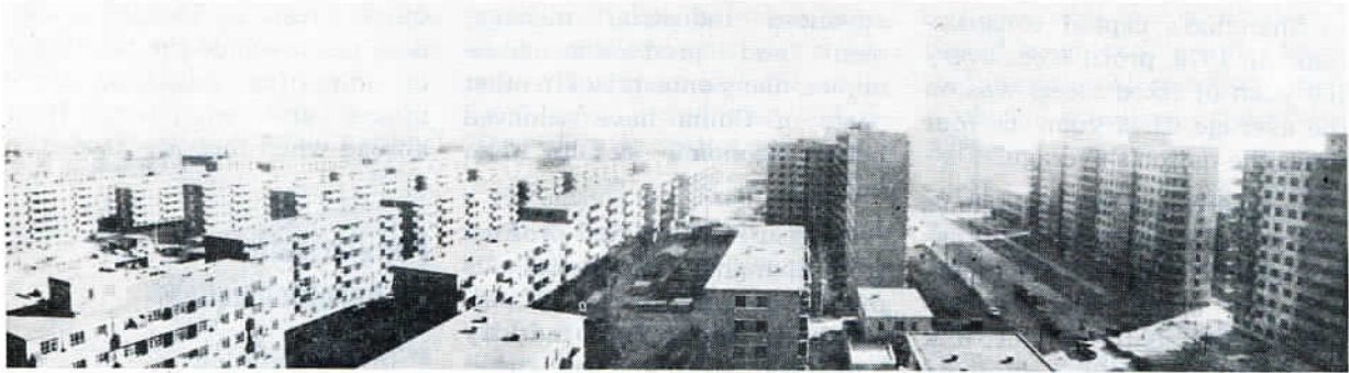
The newly built Jinsong residential quarters in the southeastern part of Beijing.

year it was 1.6 million square metres, an all-time high.) Equal importance will be given to the construction of school buildings, the state's key scientific research items, housing and other projects for foreigners and tourists.