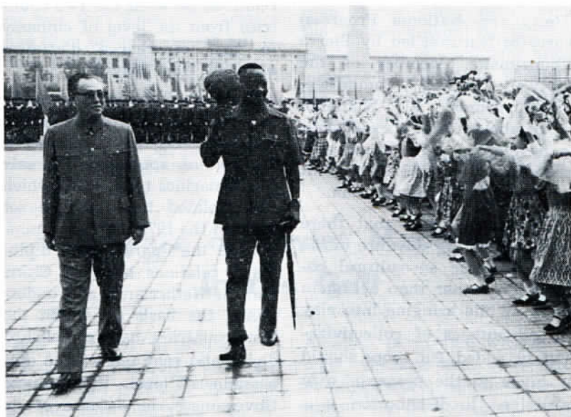
President Stevens, accompanied by Premier Zhao Ziyang, receives a rousing welcome in front of the Great Hall of the People.

Referring to the international situation, Zhao Ziyang pointed out that the Soviet policies of aggression and expansion are a threat to peace. "This," he