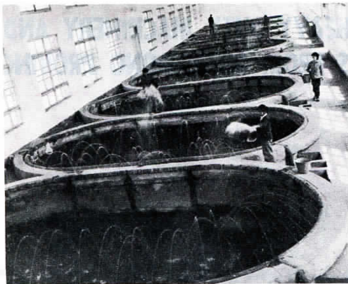
Raising fish in geothermal water in Jiangxi Province.

throughout the country. At one 10-square-kilometre geothermal field in Tibet's Yangbajain area where underground water temperatures reach 170 degrees centigrade, for example, a 1,000-kw power plant was set up in 1977, and two more geothermal installations, each with a generating capacity of 3,000-kw, are now being constructed. When completed, these power stations will supply electricity for Lhasa.