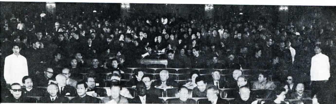
Hua Guofeng, Li Xiannian, Zhao Ziyang and other leaders at the gala party in the capital in celebration of May Day.