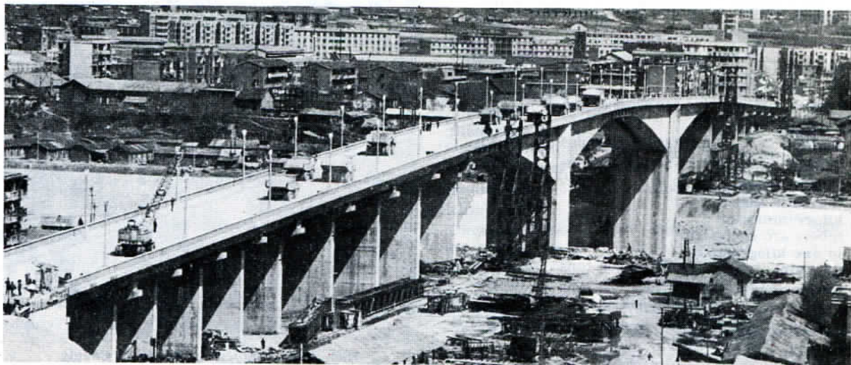
The highway bridge across the third channel of the Changjiang (Yangtze) River at Gezhouba will soon be open to traffic.

ance to drought and ability to drain off excessive water.