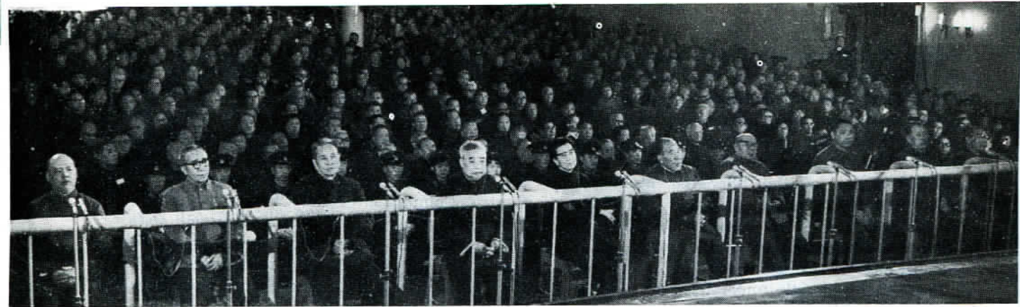
From left to right at the dock: Yao Wenyuan, Jiang Tengjiao, Qiu Huizuo, Wu Faxian, Jiang Qing, Huang Yongsheng, Chen Boda, Wang Hongwen, Li Zuopeng and Zhang Chunqiao.

the General Political Department of the Chinese People's Liberation Army (P.L.A.), first secretary of the Shanghai Municipal Committee of the C.P.C., and chairman of the Shanghai Municipal Revolutionary Committee prior to his arrest. Now in custody;