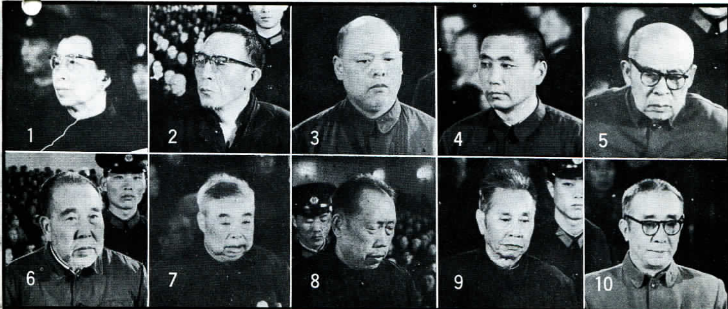
THE TEN ACCUSED (see p. 2)