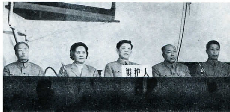
Five of the ten defence lawyers at the opening session.

Jiang Qing at first wanted to call in lawyers for her defence, and the Special Court recommended three lawyers on two occasions. In her interviews with the lawyers, Jiang Qing demanded that they act as her substitute in speaking and answering questions in court. The lawyers rejected her demands which contradicted the law, telling her that the responsibility of the defence lawyer was to safeguard the legitimate rights and interests of the accused according to facts and law, and not to act as the defendant's substitute and an-