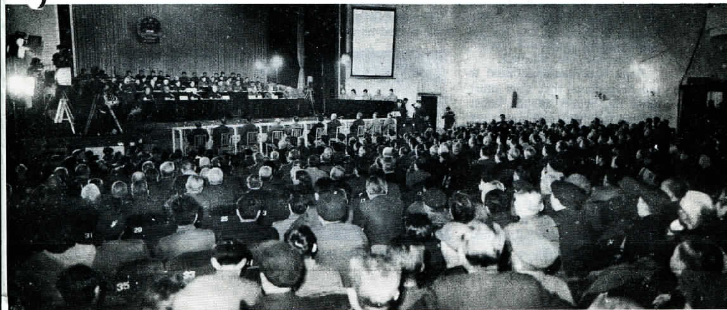
The court in session.

"In accordance with the provisions of Article 9 of the Criminal Law of the People's Republic of China with regard to the application of law," the indictment says, "this procuratorate affirms that the ten principal culprits have violated the Criminal Law of the People's Republic of China and have committed the offence of attempting to overthrow the government and split the state, the offence of attempting to engineer an armed rebellion, the offence of having people injured or murdered for counter-revolutionary ends, the offence of framing and persecuting people for counter-revolutionary ends, the offence of organizing and leading counter-revolutionary cliques, the offence of