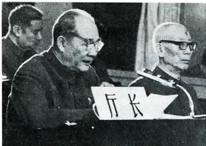
Huang Huoqing, Chief of the Special Procuratorate, reading out the indictment.

tall paper hats, and search and ransack the homes of others." "It is necessary to use measures such as the 'jet aircraft' (forcing a person to bow with both hands raised over the back like the swept-back wings of a jet plane — Tr.) against people like Peng Zhen, Luo Ruiqing, Lu Dingyi and Yang Shangkun."