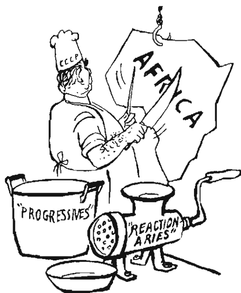
Divide and consume.

Mercenaries as Spearhead. One move the Soviet expansionists employ most in Africa is