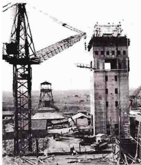
Yanzhou Colliery: Another big shaft under construction.

• Construction of the petrochemical project in northeast China's Jilin Chemical Industrial Company is proceeding briskly and the quality of work is excellent. Part of the equipment for this project, one of the 120 large construction projects undertaken by the state, is imported. Some 20 technical forums were held last year by the company for West German and Japanese technical personnel to pass on their expertise and management know-how to Chinese technicians.