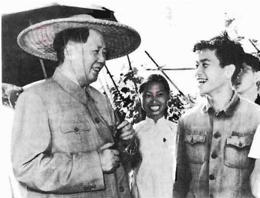
Chairman Mao on an inspection tour of Guangzhou's outskirts in 1958.

and were left half-destitute and driven to rebel, the poor peasants and farm labourers would be isolated. Some people ridiculed my approach as a rich-peasant line, yet I'm afraid my measures were the only correct ones at the time. Of course, today we have the Anti-Japanese National United Front and we are reducing rent and interest, not depriving the landlords and rich peasants of their property rights. Otherwise, it would be impossible for us to unite with them in the fight against Japan.