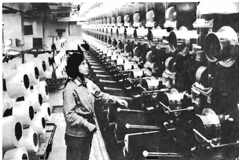
A workshop in the Shanghai Petrochemical Complex whose equipment is imported.

"It is a very good thing for us to import selectively the advanced technology and equipment from foreign countries in the light of our own needs and on the basis of equality and mutual benefit. This is for the purpose of augmenting our economic strength and underpinning the material foundation of the dictatorship of the proletariat. What's wrong with that? We must never play into the hands of Lin Biao and the 'gang of four' and do such a stupid thing as cocooning ourselves like silkworms."