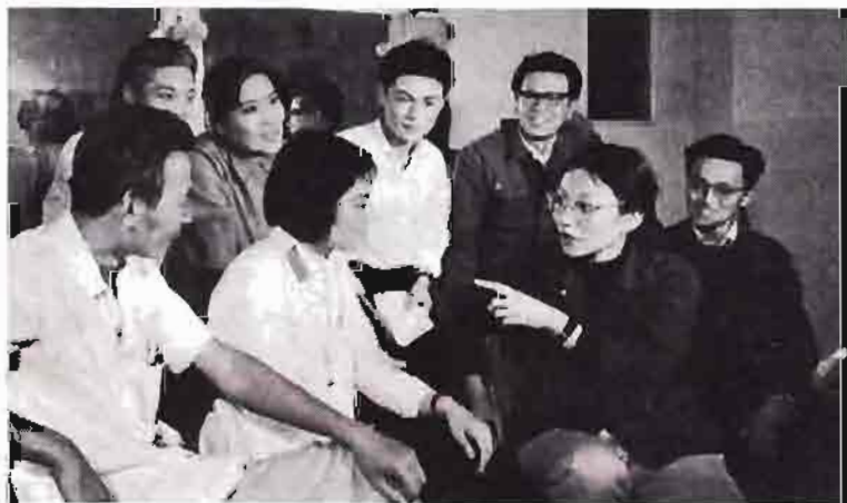
Playwright and director with the actors.

When the draft was finished, the amateur playwright solicited and received encouragement and help from all quarters. Improvements were introduced continuously during rehearsals, and even after it had been actually presented on stage. In his own words, "This play is the result of collective efforts." This, incidentally, shows a tiny