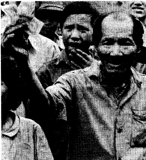
This old returned Chinese resident says: "This is all I have left after toiling for several dozen years in Viet Nam — 50 cents!"

Both in north and south Viet Nam, there were Chinese nationals who had joined the Viet-