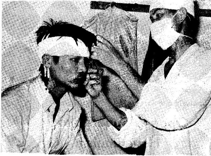
This victim, who had joined the Vietnamese people in fighting against the U.S. aggressors, suffered a head injury when he was beaten up by Vietnamese security personnel on his way back to China. A Chinese medical worker is dressing his wound.