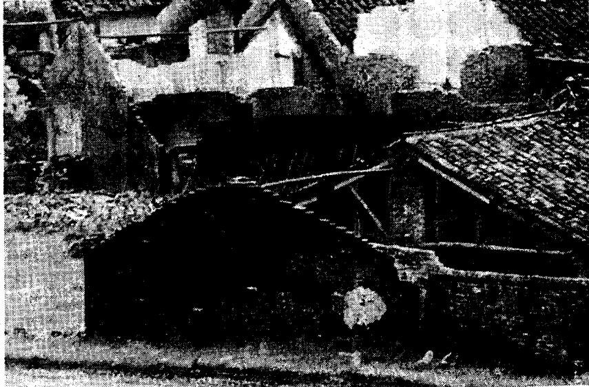
Damaged houses of Chinese residents in Deo Hang Le in Mong Cai.

According to information given by the victimized Chinese residents, as early as the first years of the 70s, the Vietnamese authorities broke their promise that Chinese residents enjoy the same rights as the Vietnamese people, and