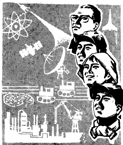
Strive to fulfil the general task for the new period.

But the Wang-Chang-Chiang-Yao "gang of four," using the portion of power they had usurped and the mass media under their control, slanderously distorted this principle and forestalled its full implementation. Theoretically, they wittingly spread the lie that to follow this principle was to "practise revisionism" and would result in a "restoration of capitalism"; this gave rise to great ideological confusion, to the extent that some of our comrades even became sceptical about the principle and were not sure whether it should be applied in the period of socialism. In practice, the gang did everything they could to obstruct and undermine its implementation, completely rejecting piecework pay and material rewards while going so far