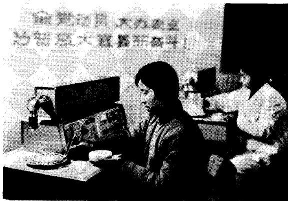
Bringing about changes in seeds with the aid of laser.

Social science magazines published in Chinese such as History Studies , Philosophical Studies , Economic Research , Literary Review and Chinese Language have resumed publication. To further research work of languages of Chinese national minorities, a journal