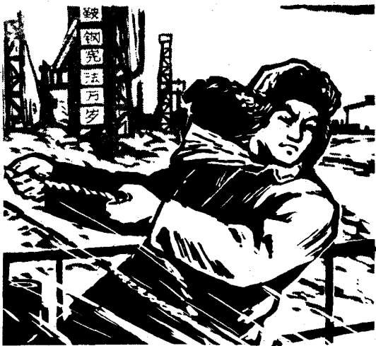
Socialist labour emulation drive.

The lofty ideal of Communists is the realization of communism which practises the principle "from each according to his ability and to each according to his needs"; we do not rest satisfied with achieving "to each according to his work." However, any loyal Marxist must understand that he shoulders the dual responsibility of fulfilling the immediate practical task and realizing the future ideal. Only by fulfilling the current task with the greatest possible thoroughness can a sound base be laid for advancing towards our future ideal. Socialist society and communist society are two different stages of economic development. The transition from socialism to communism is a fairly long and complex process of development.