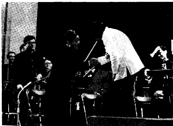
Seiji Ozawa (front right) with members of the Central Philharmonic Society.