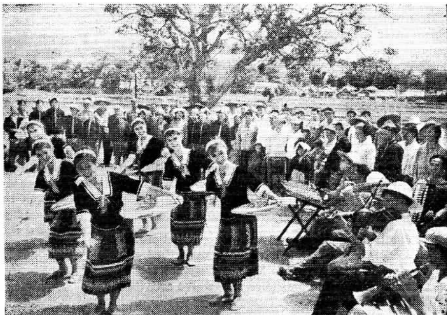
A literary and art propaganda team in a minority area, Kwangtung Province, performing for commune members of various nationalities.

Before the movement to criticize Lin Piao and Confucius, the troupe used to present full-length operas in towns but rarely went to the countryside. This led to increasing its members and props. The poor and lower-middle peasants were discontented, saying: "Our county's Peking opera troupe has changed and become divorced from us since it expanded."