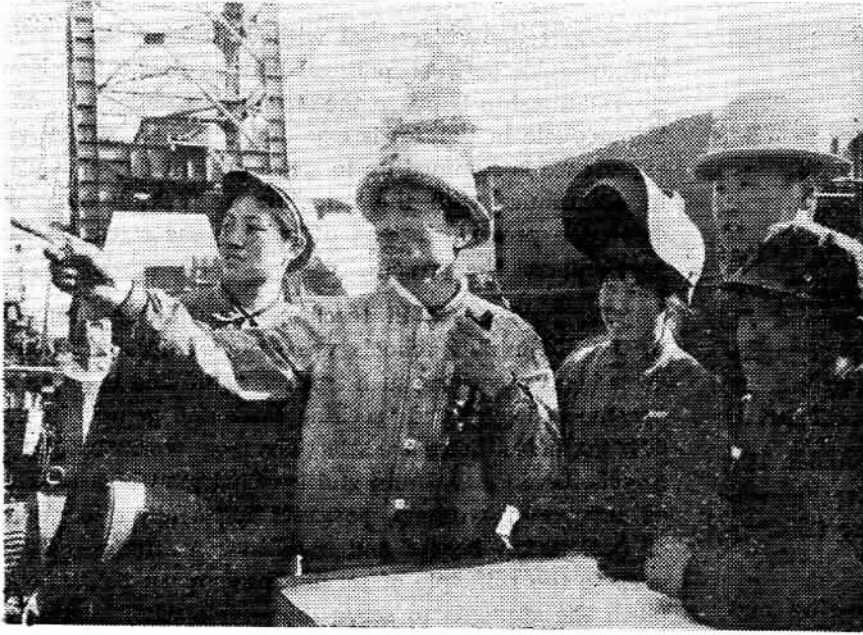
A worker of the Talien Hungchi Shipyard gives a lecture to students of the Talien Engineering Institute at the work-site.

cadres of the hull shop. Political work, teaching programme, curriculum and method of study are all discussed, decided upon and carried out by the masses under the guidance of the leading group. A large number of workers have become members of the workers' Mao Tsetung Thought propaganda team and part-time teachers at the institute.