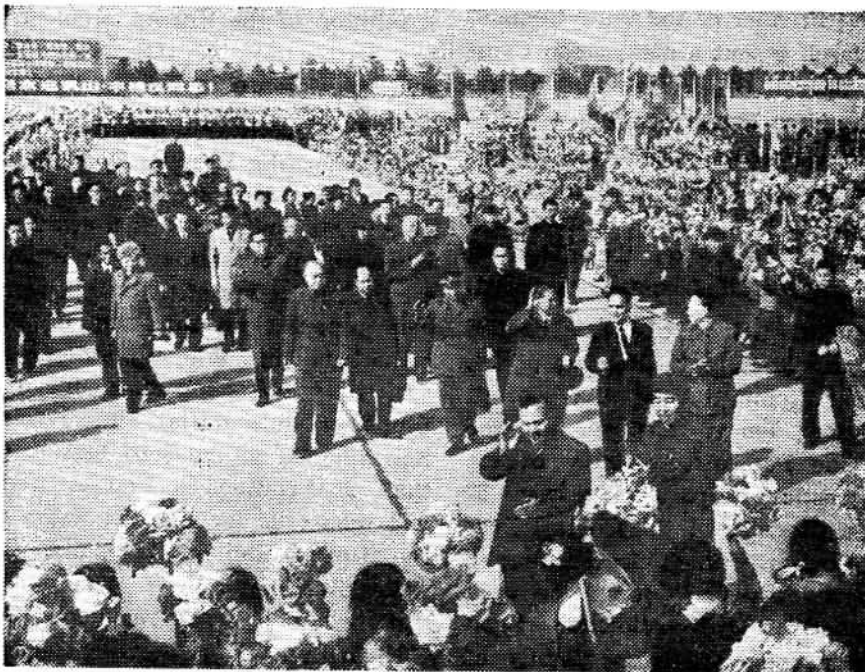
A warm welcome for the Lao Party and Government Delegation.

That evening, the Central Committee of the Communist Party of China and the State Council gave a grand banquet in the Great Hall of the People to warmly welcome the