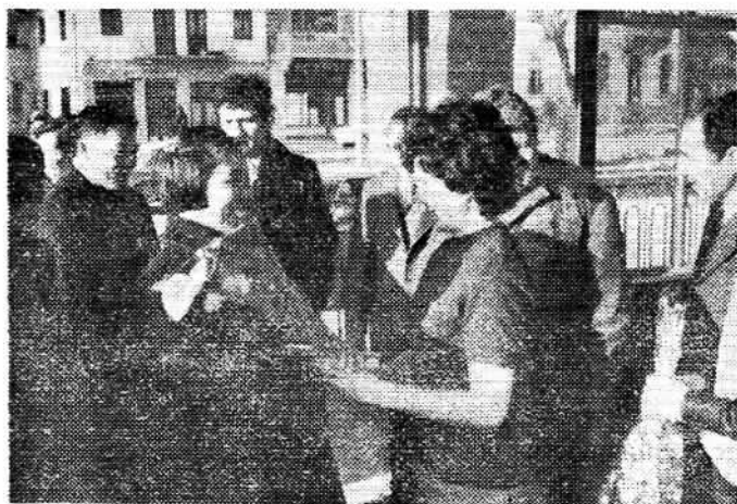
The Chinese goodwill delegation visiting a precision machinery plant in Sinaia, Romania.

At the start of the construction at the end of 1973, the problem of water supply threatened to bring the work to a halt. To overcome the difficulty, Nepalese and Chinese builders decided to sink wells themselves. In a race against time, they worked round-the-clock in three shifts despite the severely cold weather; following this they persisted earnestly and meticulously throughout the rainy season, undeterred by heavy downpour or broiling sun. Both Nepalese and Chinese personnel at the construction site showed great concern for each other's safety in erecting poles and setting up the wires overhead. One day, a Nepalese working in an elevator car rested one