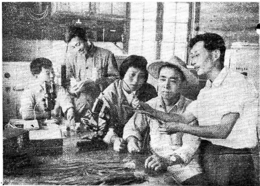
Teachers of Shanghai's Fudan University discussing the prevention of insect pests on rice with commune members.

Dialectical materialism is applied in presenting the new teaching material for natural science courses, and idealist and metaphysical conceptions are eliminated. Peking University translated and published the Mathematical Manuscripts by Marx. On the basis of their study of this book and Engels' Dialectics of Nature , the teachers and students of Peking University and their counterparts in Shanghai, Sian and Talien made changes in the teaching material for higher mathematics. They applied the viewpoint of the unity of opposites between positive and negative and between quality and quantity to elucidate the dialectical nature of differential and integral calculus and eliminate the metaphysical influence in this branch of mathematics. This has increased the effectiveness of lectures on mathematics in