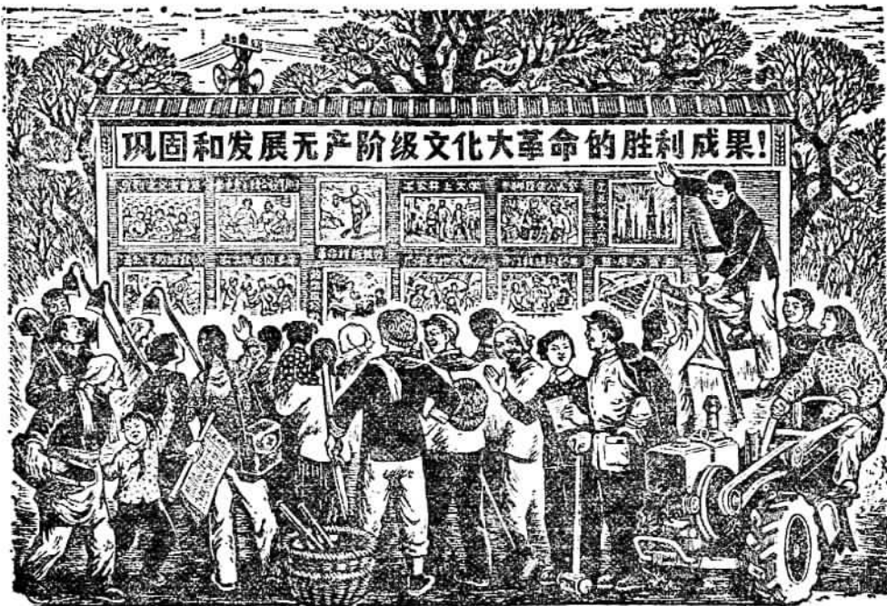
Putting up posters eulogizing the tremendous achievements of the Great Proletarian Cultural Revolution.