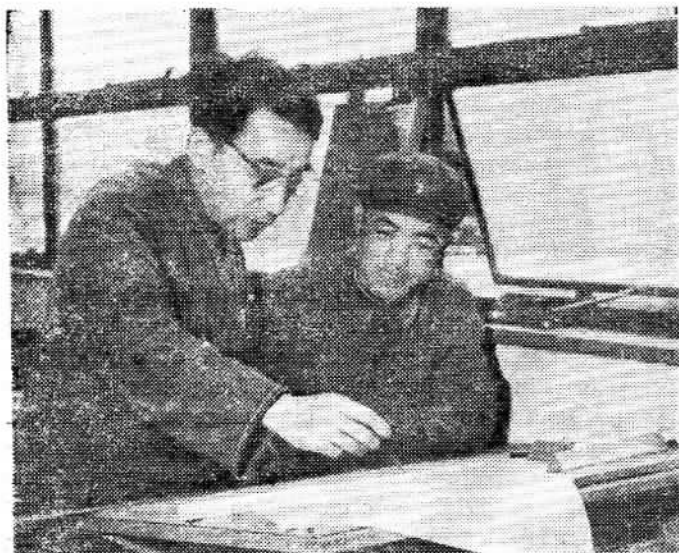
The author, an associate professor at Tungchi University, teaching a soldier-student designing.

According to the Party's policy that "education must serve proletarian politics and be combined with productive labour," the first group of worker-peasant-soldier students were enrolled in 1969. Lessons were given at the work-sites and teaching was integrated with the designing of the projects and actual construction. I began taking part in teaching activities at a work-site for the first time.