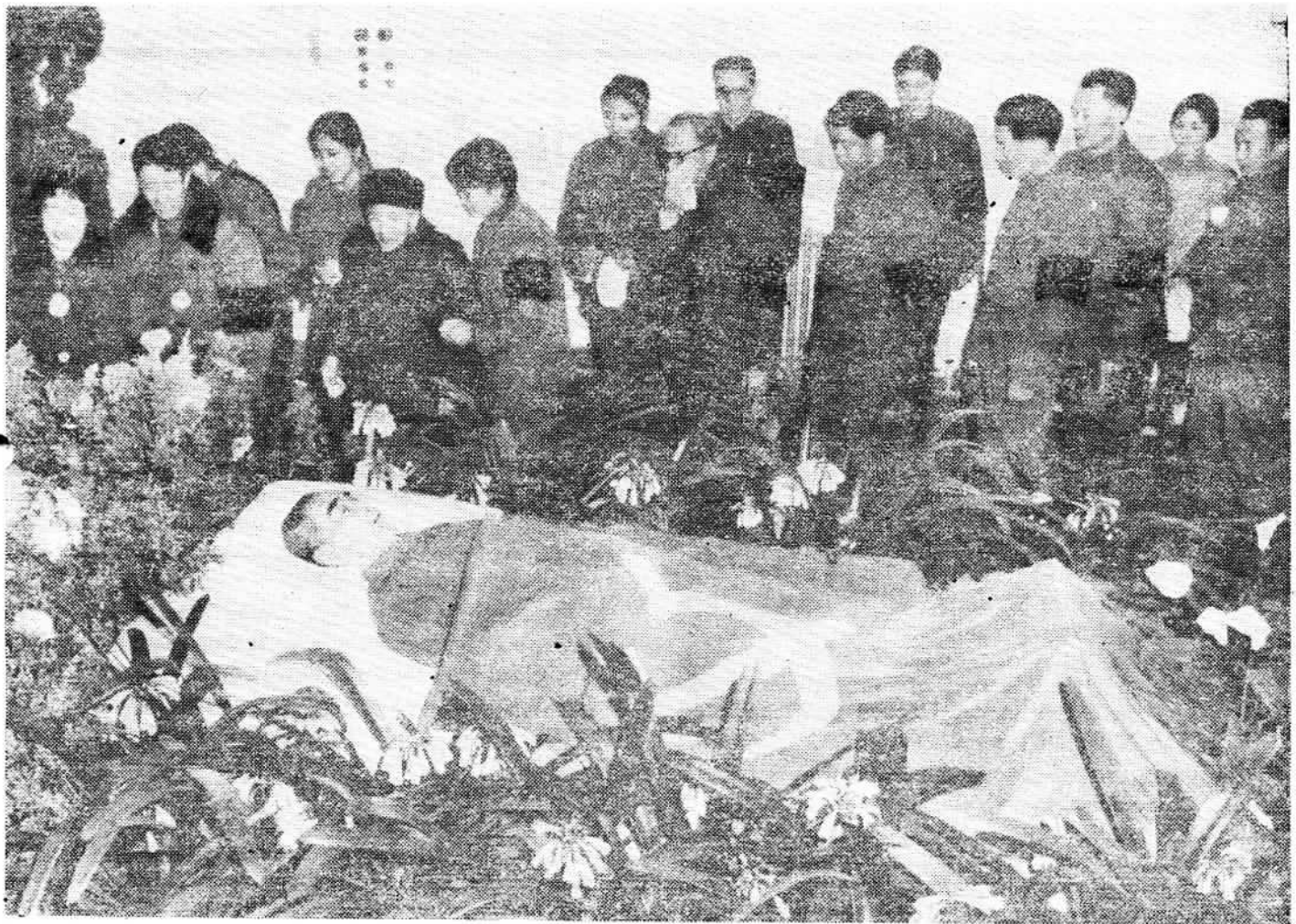
Representatives of the people in Peking pay their last respects to the remains of Comrade Chou En-lai.