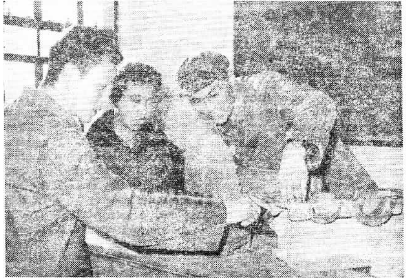
Worker-teacher (right) coaching students.

In order to effect a change to theory being divorced from reality, we link what we teach with typical projects. (We select a project with the teachers and students responsible for its designing and construction and teaching is conducted in connection with the building of this project.) Once, teaching in one of the classes was to be linked with designing a single-story factory building. The teacher in charge of the class was afraid to take on the responsibility for the project, thinking that it was too hazardous. The designer taking part