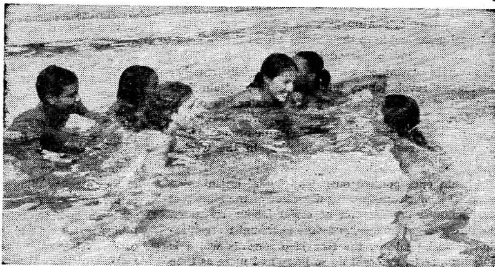
Talking shop in the swimming pool.