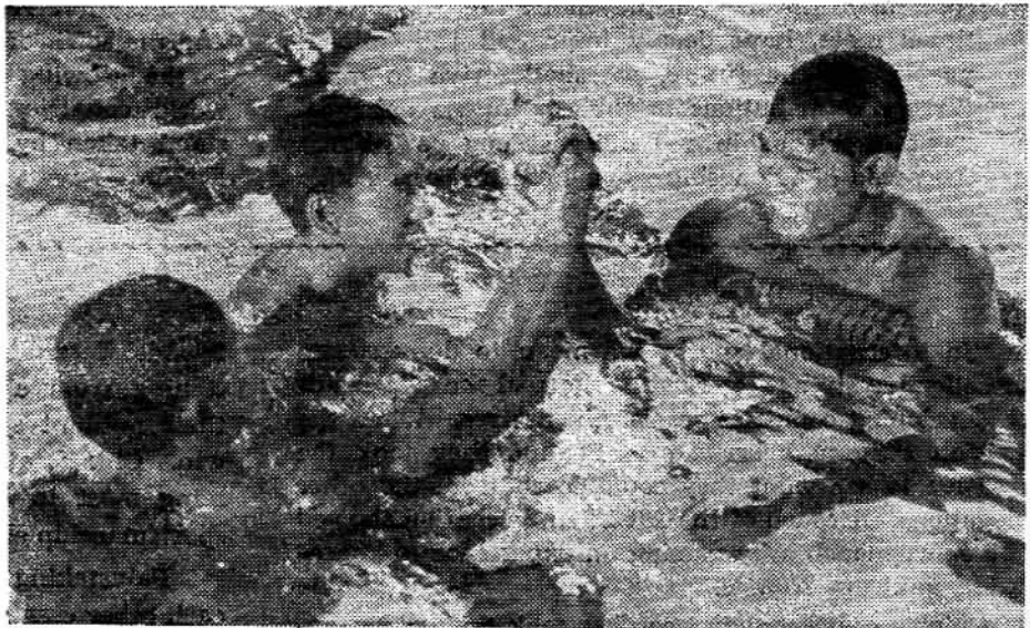
Congratulating each other after the event.

Those from countries where swimming became a popular sport only recently regarded this invitational meet as an opportunity to promote friendship and learn from swimmers of other lands. After their arrival in Peking, they went for their workouts vigorously and before long they had made many friends and improved their skill. Quite a few of them remarked with great satisfaction: This kind of friendship invitational meet suits the need of athletes of the developing countries well.