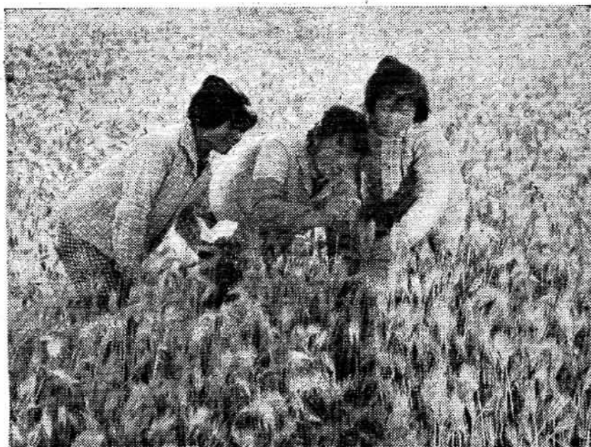
In an experimental plot.

Thanks to the overthrow of imperialism, feudalism and bureaucrat-capitalism after the founding of New China, Shanghai's peasants have embarked on the road of socialist collectivization and rapidly developed production under the leadership of the Communist Party.