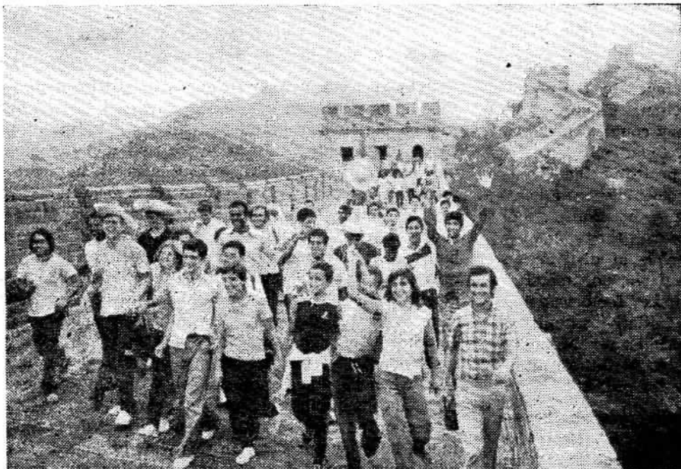
Sight-seeing at the Great Wall.

T HE Peking International Swimming and Diving Friendship Invitational Meet drew to a triumphant close on August 10, having lasted for eight days.