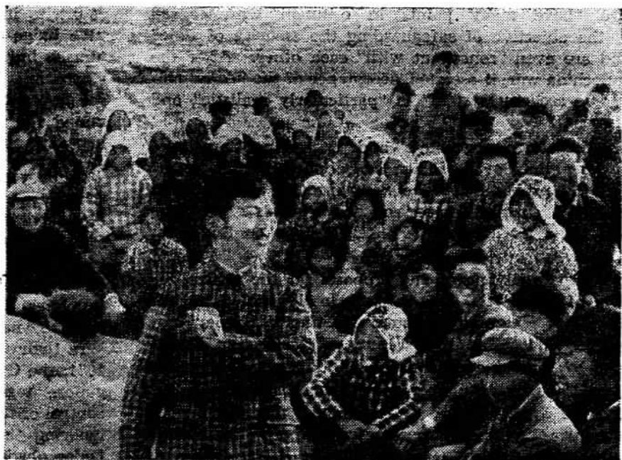
Commune members listening to a revolutionary story during their work-break.

The afore-mentioned figures serve to hit another nail into the coffin of the old and new Malthusian "surplus-population" theory. Marx pointed out: "Capitalistic accumulation itself . . . constantly produces . . . a relatively redundant population of labourers, i.e., a population of greater extent than suffices for the average needs of the self-expansion of capital, and therefore a surplus-population." ( Capital .) Surplus-population is a product specifically of the capitalist mode of production. In socialist China, all who are able to work are given a job which is within the reach of their ability. The phenomenon of unemployment has become a thing of the past in this part of the world.