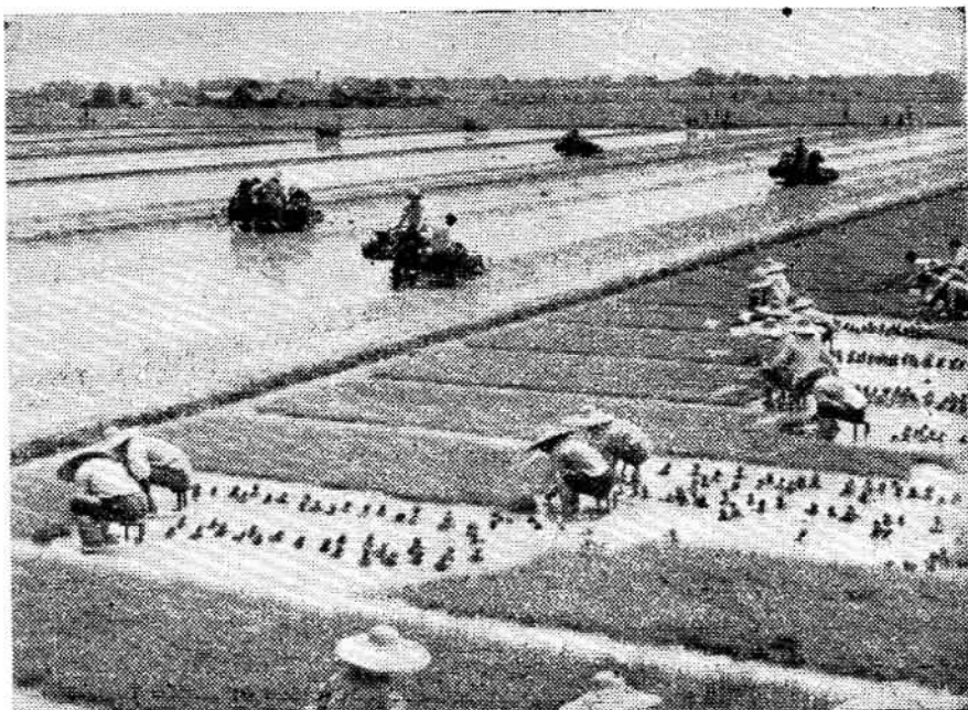
Transplanting rice seedlings.

On the strength of the unequal treaties concluded with the Chinese reactionary government, the imperialists marked off large tracts in Shanghai as their "concessions" and proceeded from these bases to expand their occupied areas to the villages on the outskirts. Statistics show that foreign imperialist elements seized as much as 2,000 hectares of land in suburban Shanghai on the pretext of building roads alone. One year when a certain imperialist country's consulate wanted to build a golf course, the consul sent