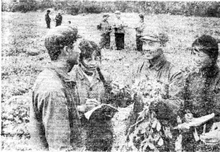
Students of Chaoyang Agricultural College are summing up their experience in achieving high yields of peanut on the experimental plot they have cultivated.

in a year and how long do they stay each time vary for different specialities and different classes. This method ensures that the students are in close touch with class struggle, the struggle for production and scientific experiment in the countryside.