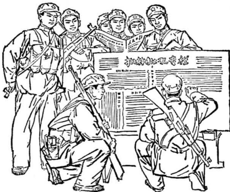
P.L.A. fighters putting out a blackboard newspaper criticizing Lin Piao and Confucius.

But Confucius and the Confucian school after his time advocated "chung yung" (the doctrine of the mean), regarding unity as absolute and describing decadent old things as sacred and inviolable. According to them, "not leaning to either side is called chung; being unchangeable is called yung." Everything should be done in accordance with the slave system's moral