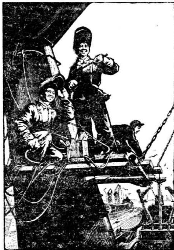
Women shipyard workers.