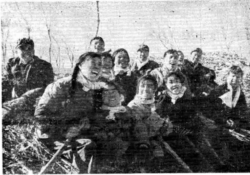
Young women and men commune members of a production team in suburban Tientsin take a break.

ciple, the masses of rural women in the liberated areas were further mobilized and organized to take part in handicrafts and side-line occupations and in farm production. Their participation in productive labour gave enormous support to the War of Resistance Against Japan and the War of Liberation, and further promoted the women's movement.