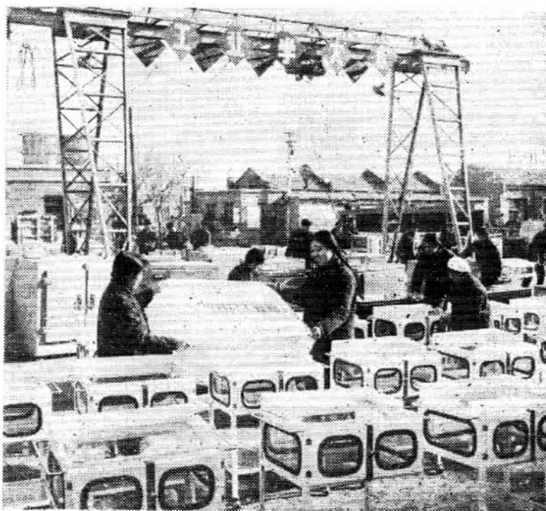
Developed from a neighbourhood workshop run by housewives, an instrument factory in Tientsin is making dryers and a dozen other products for scientific research.

Our great leader Chairman Mao and the Chinese Communist Party have always stressed the need for mobilizing women to take part in social production. Towards the end of the 1920s, the political power in the revolutionary base areas led by the Chinese Communist Party paid attention to this work. Later, in the Shensi-Kansu-Ningsia Border Area, organizing women to take part in labour and production was regarded as an important task of the women's movement. In 1943 when the War of Resistance Against Japan was approaching victory and times were still very hard, the Party Central Committee made a decision on the policy for women's work in the anti-Japanese base areas. The decision pointed out: Like young men fighting at the front, women devoting their efforts to production are carrying out a militant and glorious task. Moreover, the road of raising women's political position, educational level and standard of living so as to achieve emancipation should also start with economic well-being and economic independence. In keeping with this prin-