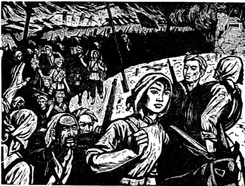
Men and women guerrillas returning to their base after destroying an enemy transport line during the War of Resistance Against Japan.

For the broad masses of women to win liberation they must take part in social revolution. For the revolution led by the proletariat to win victory it must have the participation of the broad masses of women. Marx said: "Anybody who knows anything of history knows that great social changes are impossible without the feminine ferment." And Lenin said: "There can