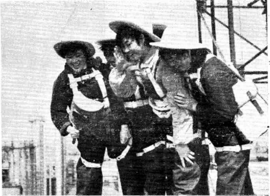
Women's crew working on a high scaffold.

In pointing out the only correct path for the Chinese revolution, the great leader of the Chinese people Chairman Mao also pointed out the only correct path for Chinese women to win complete liberation. In 1927, Chairman Mao said in his work Report on an Investiga-