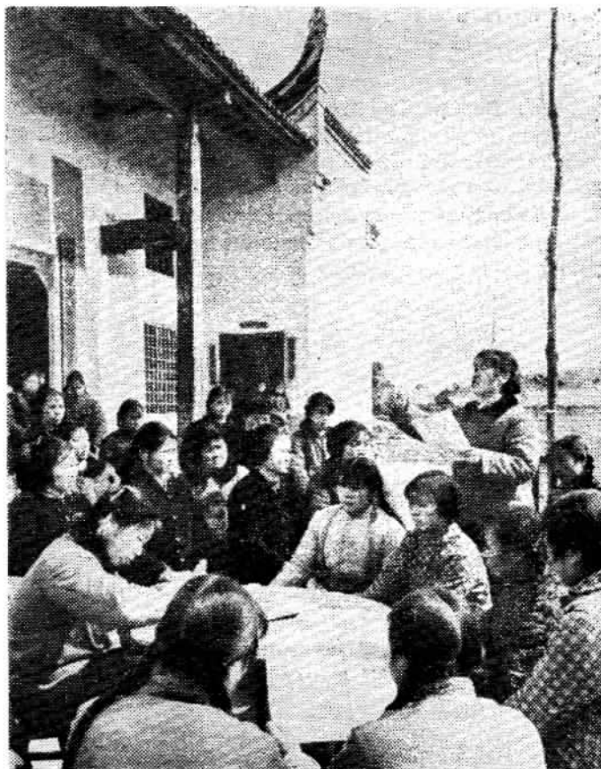
Women of the Paikuo Commune meet to criticize the reactionary fallacies on women spread by Lin Piao and Confucius.

But the acute struggle between the two classes and the two lines on the question of women's emancipation is still there. Following in the footsteps of the monarchs of the old feudal dynasties, Liu Shao-chi and Lin Piao, representatives of the landlord and capitalist classes who had wormed their way into the Party, tried to peddle the doctrine of Confucius and Mencius under