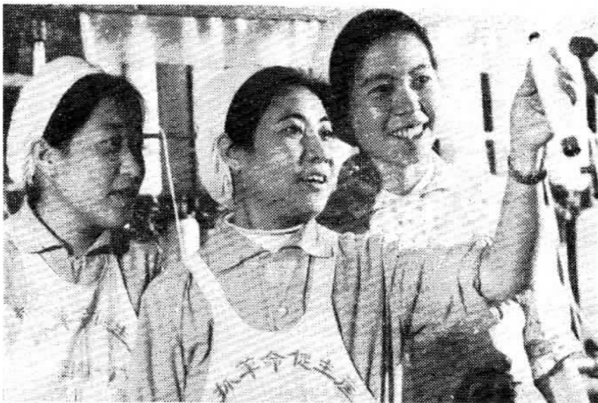
Textile worker Wu Kuei-hsien (centre) is discussing with workers of the fine yarn shop of the No. 1 State Cotton Mill in northwest China to improve the quality of products. Wu Kuei-hsien is Alternate Member of the Political Bureau of the Party Central Committee and Secretary of the Shensi Provincial Committee of the Chinese Communist Party.

Precisely because hundreds of millions of Chinese women took an active part in the revolutionary strug-