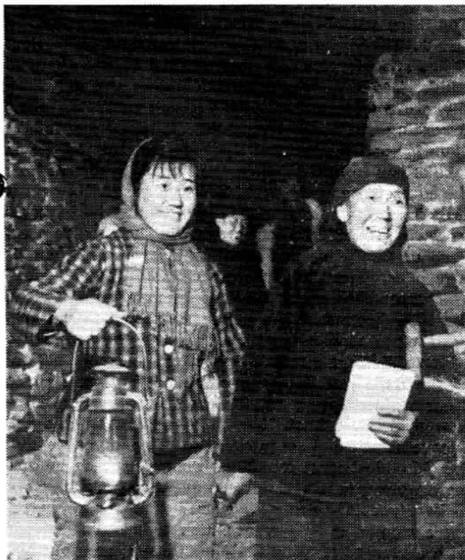
Members of a commune in Shansi Province off to study Chairman Mao's works in a night school run by their brigade.

Age-old oppression and enslavement of Chinese women is gone for ever. The establishment of the socialist system has opened up boundless vistas for their complete liberation. However, the reactionary forces scheming to turn back the wheel of history still remain. We must smash their plots for retrogression and restoration of the old order. Remnants of the old concept that "men are superior and women are inferior" and old habits and customs left over from the old society have still to be thoroughly eliminated. The current nationwide revolutionary movement to criticize Lin Piao and Confucius will inevitably become a tremendous force propelling China's women to win complete liberation.