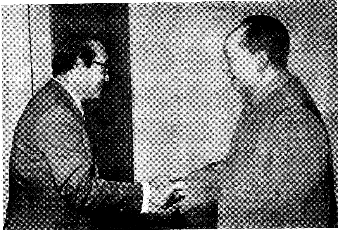
Chairman Mao shakes hands with Chairman Ne Win.

C HAIRMAN MAO, the great leader of the Chinese people, on August 7 met Ne Win, Chairman of the Revolutionary Council and Prime Minister of the Government of the Union of Burma, and Madame Ne Win and his entourage.