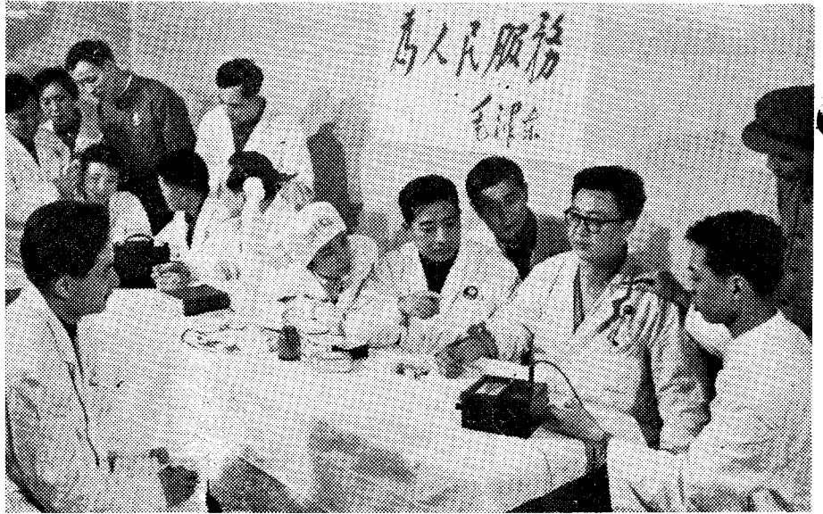
Scientific and medical workers in Shanghai experiment with needling on their own bodies to test the degree of pain and find new points for effective needling and new methods of stimulation.

No sooner had acupunctural anaesthesia appeared than it was suppressed by Liu Shao-chi's counter-revolutionary revisionist line and attacked by bourgeois "experts." In a vain attempt to nip it in the bud, they raved that it was "not scientific," "without any practical value" and a "retrogression" in the history of anaesthesia.