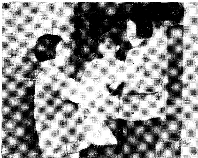
The clerk finally finds the customer who has been given less flour than what she has paid for.