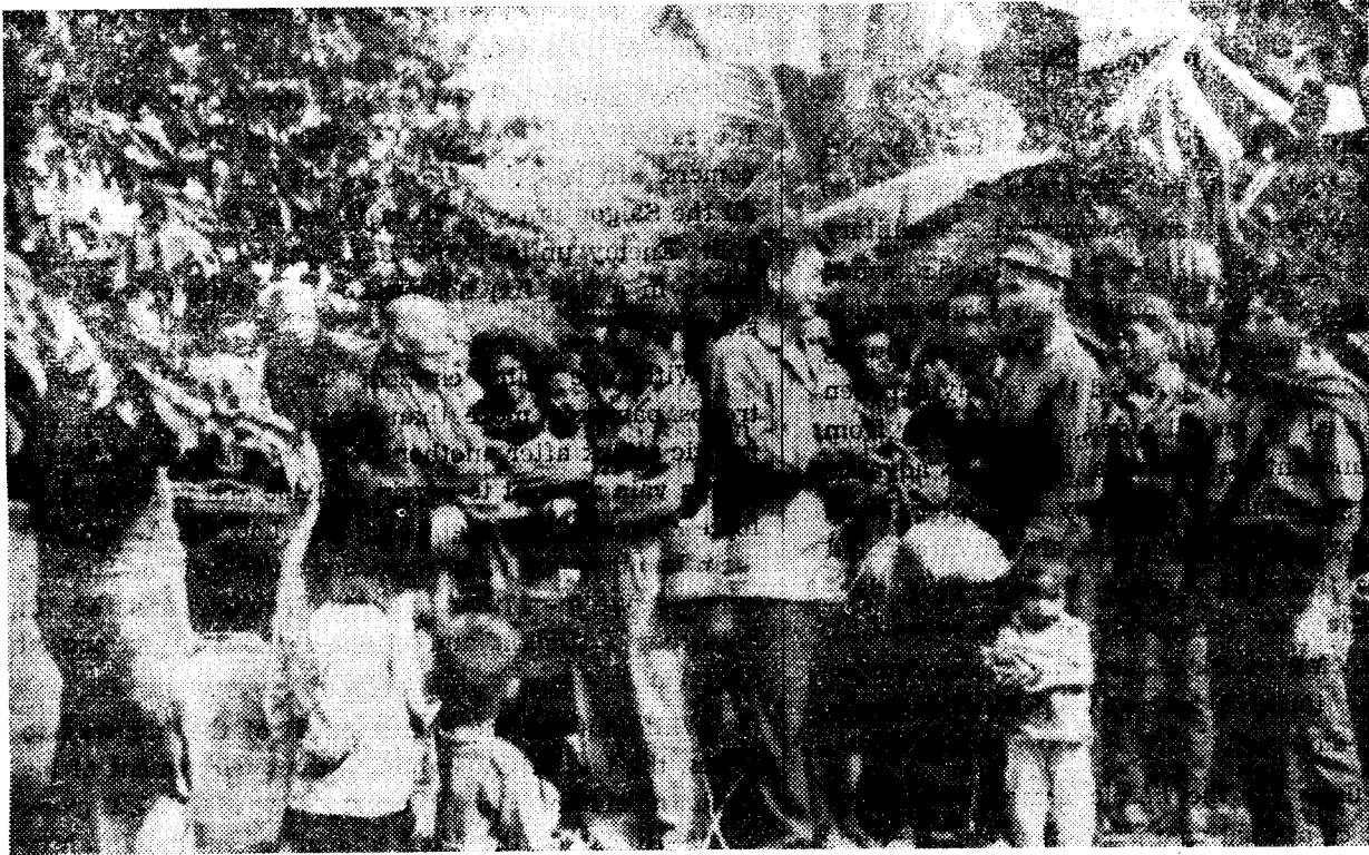
People of a liberated area in Cambodia warmly welcome the triumphant return of the fighters of the National Liberation Armed Forces.