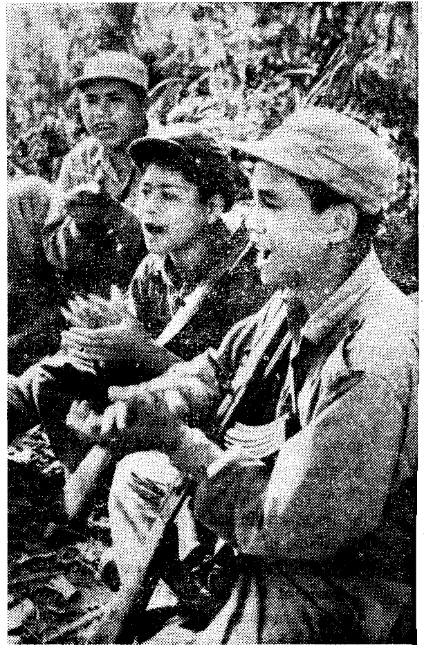
Lao P.L.A. fighters singing militant songs of victory at the battlefield.