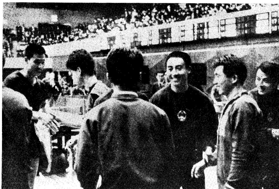
Chinese players chatting with players from other countries.

After the matches, the players from the Democratic People's Republic of Korea, the United Arab Republic and China encouraged and learnt from each other. The Korean players put the stress on playing their best at the championships, and at the same time learning from the players of other countries. Referring to the current championships, the Chinese players emphasized: "Wins and losses in contests are transient, but friendship is ever-lasting," and that since the strong has weaknesses and the weak has its strong points it is necessary to learn from each other.