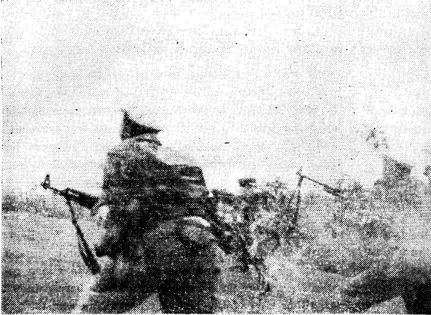
The Lao People's Liberation Army heroically wiping out the enemy.