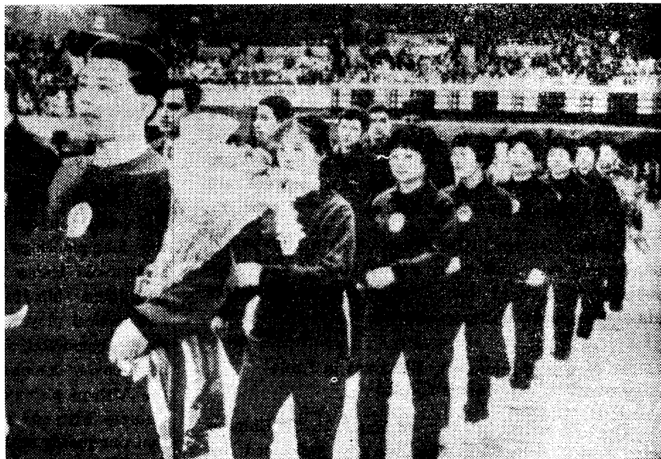
Chinese players entering the competition hall for the championships' opening ceremony.

Through five days of competition and other forms of contact, the players from five continents promoted