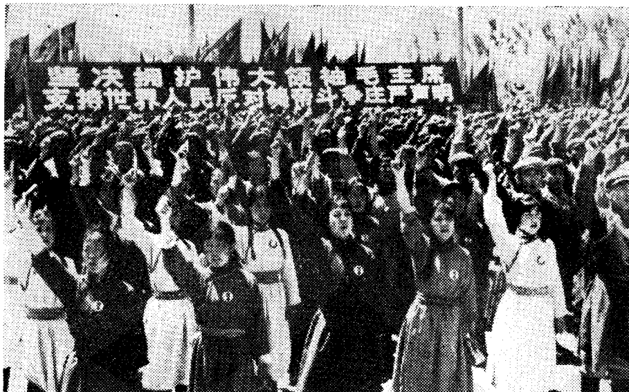
Revolutionary people of various nationalities in Huhehot, Inner Mongolian Autonomous Region, held a massive rally and demonstration on May 21.

In studying Chairman Mao's statement, the commanders and fighters of many heroic companies of the People's Liberation Army, which had won honoured titles for their exploits during the War of Resistance Against Japan, the Liberation War and the War to Resist U.S. Aggression and Aid Korea, as well as veteran guerrilla fighters and militiamen who had over the long years persisted in struggle behind the enemy lines, reviewed the history of their heroic struggles in defeating the Japanese and U.S. aggressors by the methods of making use of the few to defeat the many and of the weak to defeat the strong. The masses of armymen and civilians noted that the Chinese people, relying on invincible Mao Tsetung Thought, dared to rise in struggle, dared to take up arms and, with swords and spears and with millet plus rifles, fought all the way from the Ching kang Mountains to Yen an, from the Changpai Mountains to Hainan Island. The Chinese people, displaying the heroism of " Rolling back the enemy as we would a mat, " as described by Chairman Mao in one of his poems, defeated Japanese imperialism which was armed to the teeth, wiped out the eight million strong Chiang gang troops in the pay of U.S. imperialism and, alongside the Korean People's Army,