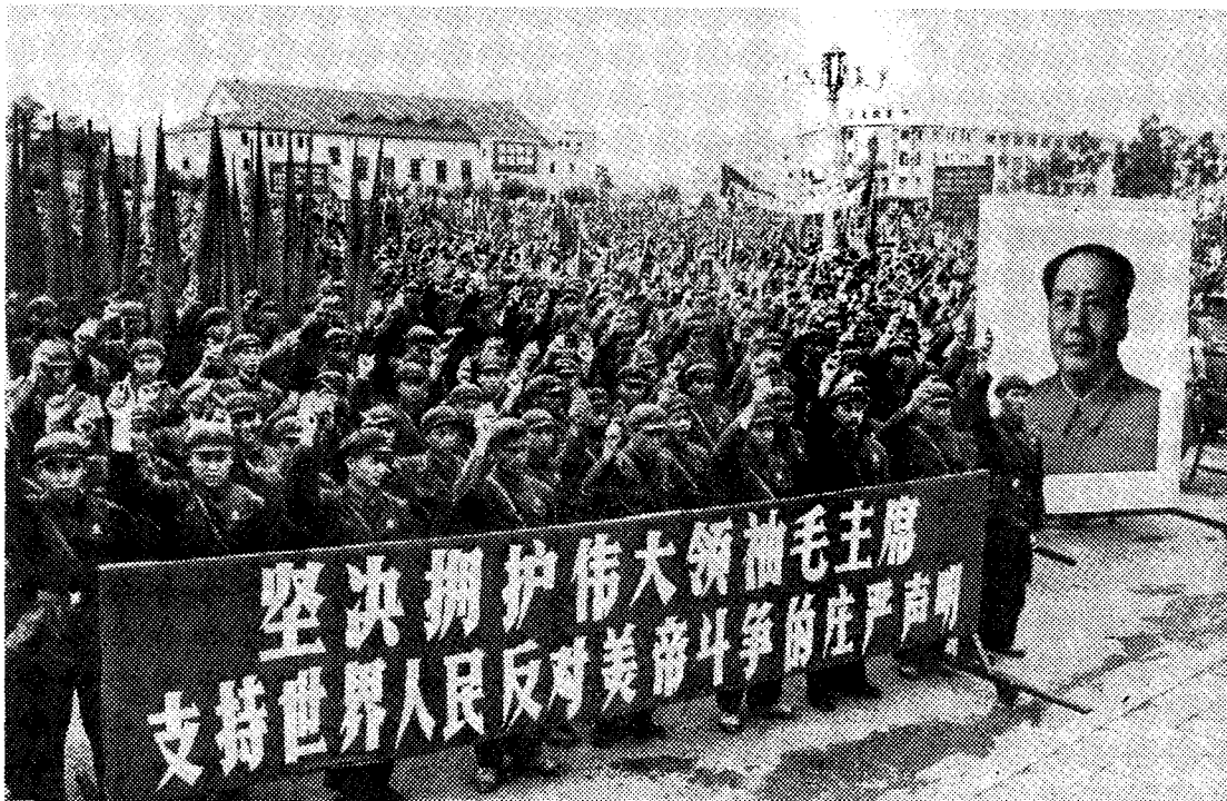
150,000 army men and civilians in Nanning, Kwangsi, at the forefront of supporting Viet Nam in resisting U.S. aggressors, held a grand rally on May 21.

While studying Chairman Mao's statement, the poor and lower-middle peasants in Humen of Kwangtung Province and Sanyuanli on the outskirts of Kwangchow recalled how their revolutionary forefathers had used hoes, sickles, swords, spears and primitive cannon to valiantly fight against the imperialist aggressor troops. They hailed the successive victories won by the people of the three Indo-Chinese countries in their war of resistance against U.S. aggression and for national salvation. The poor and lower-middle peasants of Sanyuanli said that Chairman Mao's statement sums up the experience of the people of China and the rest of the world in their revolutionary struggles. U.S. imperialism, the paper tiger now in the throes of its death-bed struggle, will surely be drowned in the vast ocean of a people's war.