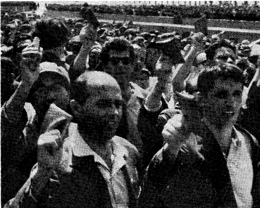
With their copies of Quotations From Chairman Mao Tsetung in their hands, foreign friends attending the Peking mass rally in support of the struggle of the world's people against U.S. imperialism joyously greet Chairman Mao.