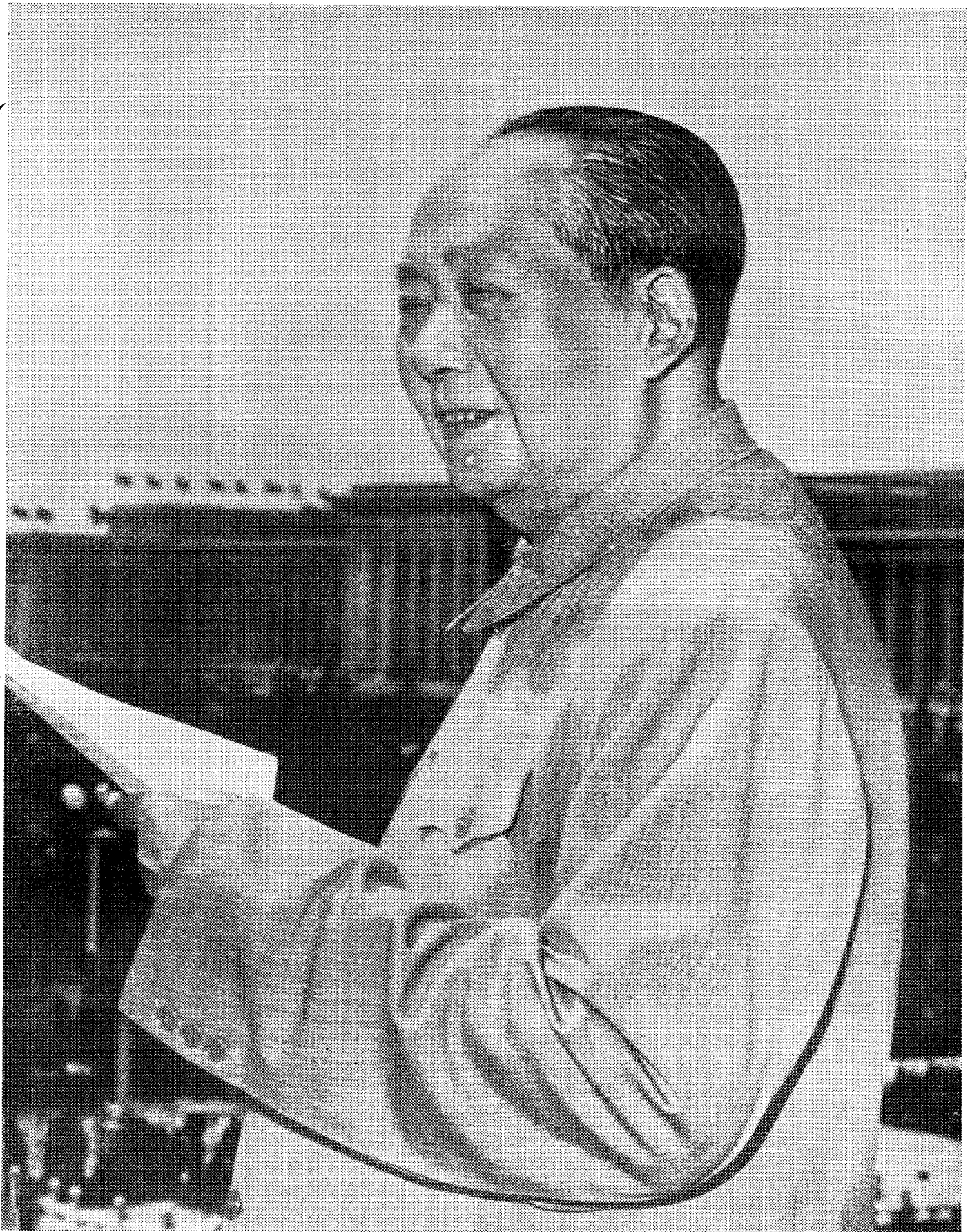
Our most respected and beloved great leader Chairman Mao on the rostrum at the rally held by the people in the capital on May 21 in support of the struggle of the world's people against U.S. imperialism.