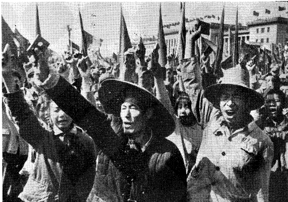
The poor and lower-middle peasants from the outskirts of Peking attending the rally raise their arms and shout: "Firm support to the three Indo-Chinese peoples' war of resistance against U.S. aggression and for national salvation!" and "U.S. imperialism is bound to be defeated! The people of the world are sure to win!"

Chairman Mao, Vice-Chairman Lin and Samdech Norodom Sihanouk cordially shook hands and talked