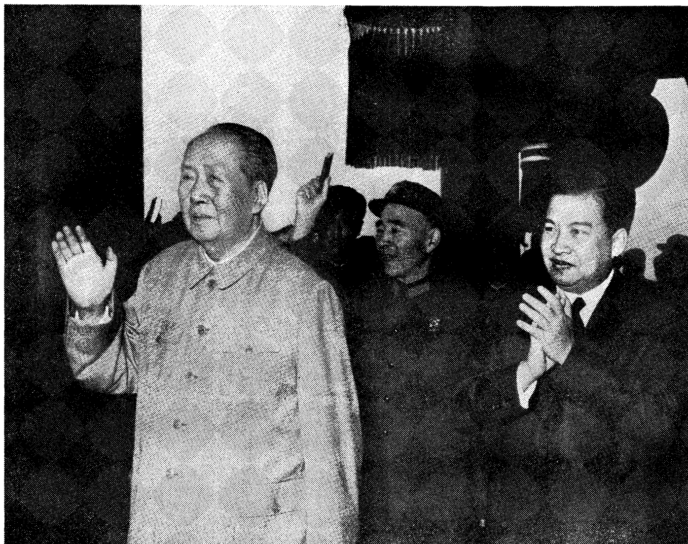
Our great leader Chairman Mao and his close comrade-in-arms Vice-Chairman Lin Piao with Samdech Norodom Sihanouk, Head of State of Cambodia and Chairman of the National United Front of Kampuchea, on the rostrum at the Peking mass rally supporting the struggle of the world's people against U.S. imperialism.