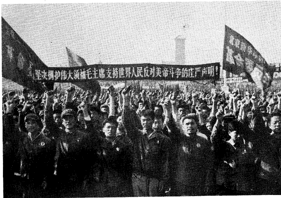
The capital's workers attending the rally express their firm determination to respond to the great leader Chairman Mao's call, display the spirit of proletarian internationalism and with concrete action support the world's people in their struggle against U.S. imperialism.

China; Members of the Political Bureau of the Party Central Committee now in Peking (listed in the order of the number of strokes in their surnames): Yeh Chun, Chiang Ching, Li Hsien-nien, Li Tso-peng, Wu Fa-hsien, Chiu Hui-tso, Yao Wen-yuan and Huang Yung-sheng; and Alternate Members of the Political Bureau of the Party Central Committee: Chi Teng-kuei, Li Teh-sheng and Wang Tung-hsing.