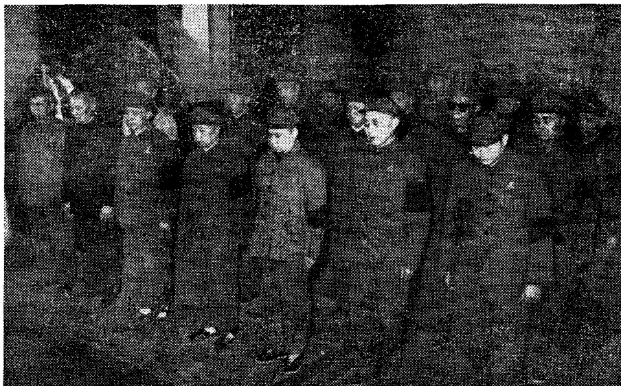
Leading comrades of the Chinese People's Liberation Army stand in silent tribute before the portrait of President Ho Chi Minh.