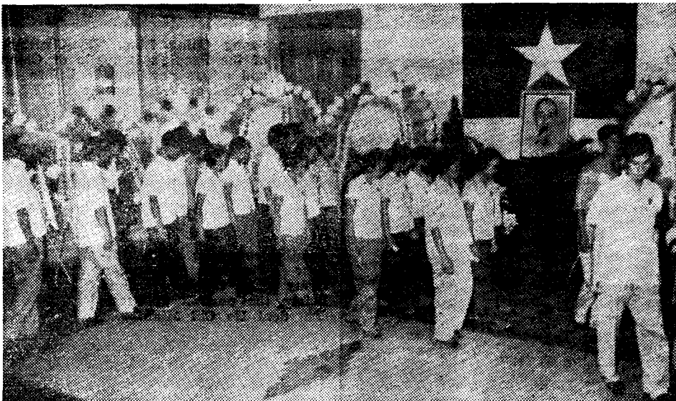
Revolutionary masses in the Kwangsi Chuang Autonomous Region and Nanning tender condolences at the D.R.V.N. Consulate-General in Nanning on the unfortunate death of President Ho Chi Minh.

Expressing their profound proletarian feelings, the mourners said that though President Ho Chi Minh had