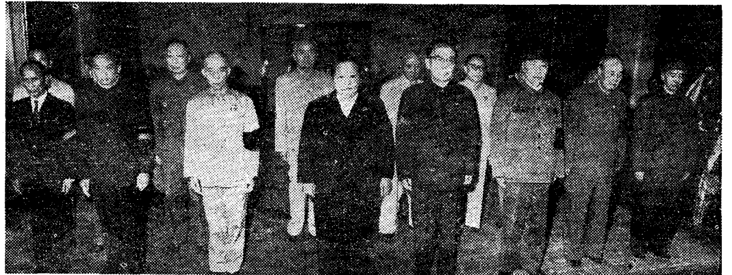
Soong Ching Ling, Vice-Chairman of the People's Republic of China, and others pay homage before the portrait of President Ho Chi Minh.