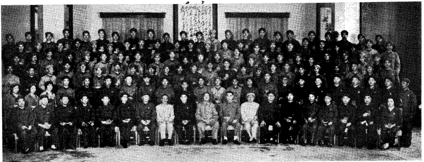
Chairman Mao, Vice-Chairman Lin Piao and Chou En-lai, Chen Po-ta, Kang Sheng and other comrades with delegates to the conference.