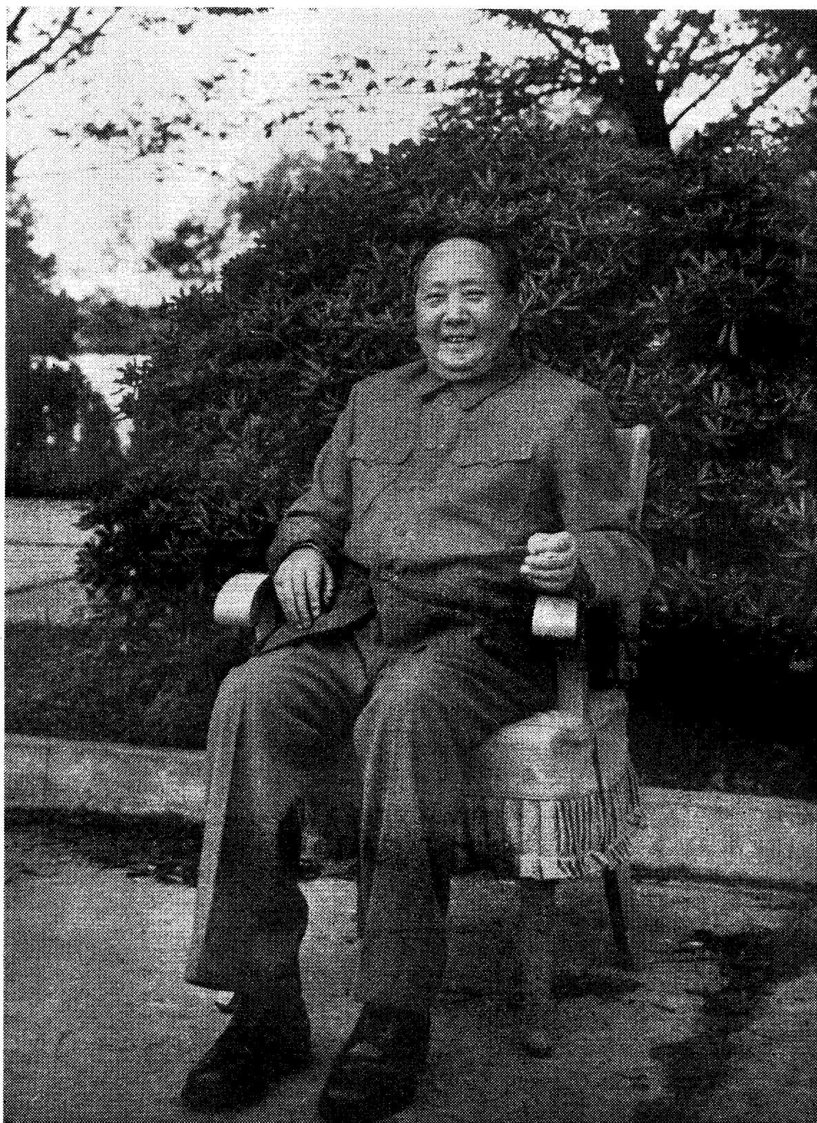
Chairman Mao Tse-tung

Our great teacher, great leader, great supreme commander and great helmsman