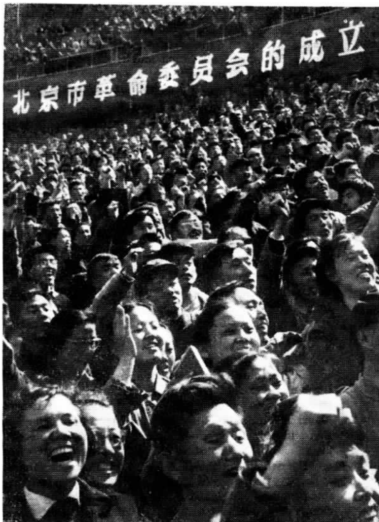
Peking's revolutionary masses cheer the birth of the Peking Municipal Revolutionary Committee, a great victory for Mao Tse-tung's thought.

reorganize the Peking Municipal Party Committee, it was a new great leap in the struggle of the capital's proletarian revolutionaries to seize power. The founding of the Peking Municipal Revolutionary Committee has carried the great proletarian cultural revolution in the capital to a completely new stage and set a fine example for people throughout the country. It shows that the great cultural revolution has solved a most important new problem in the proletarian revolution of our era; it has provided new experience in preventing a capitalist restoration after the seizure of power by the proletariat, and in consolidating and developing the dictatorship of the proletariat and carrying the socialist revolution through to the end. It has thus enriched and developed the Marxist theory of scientific socialism and added an immortal page to the annals of the international communist movement.