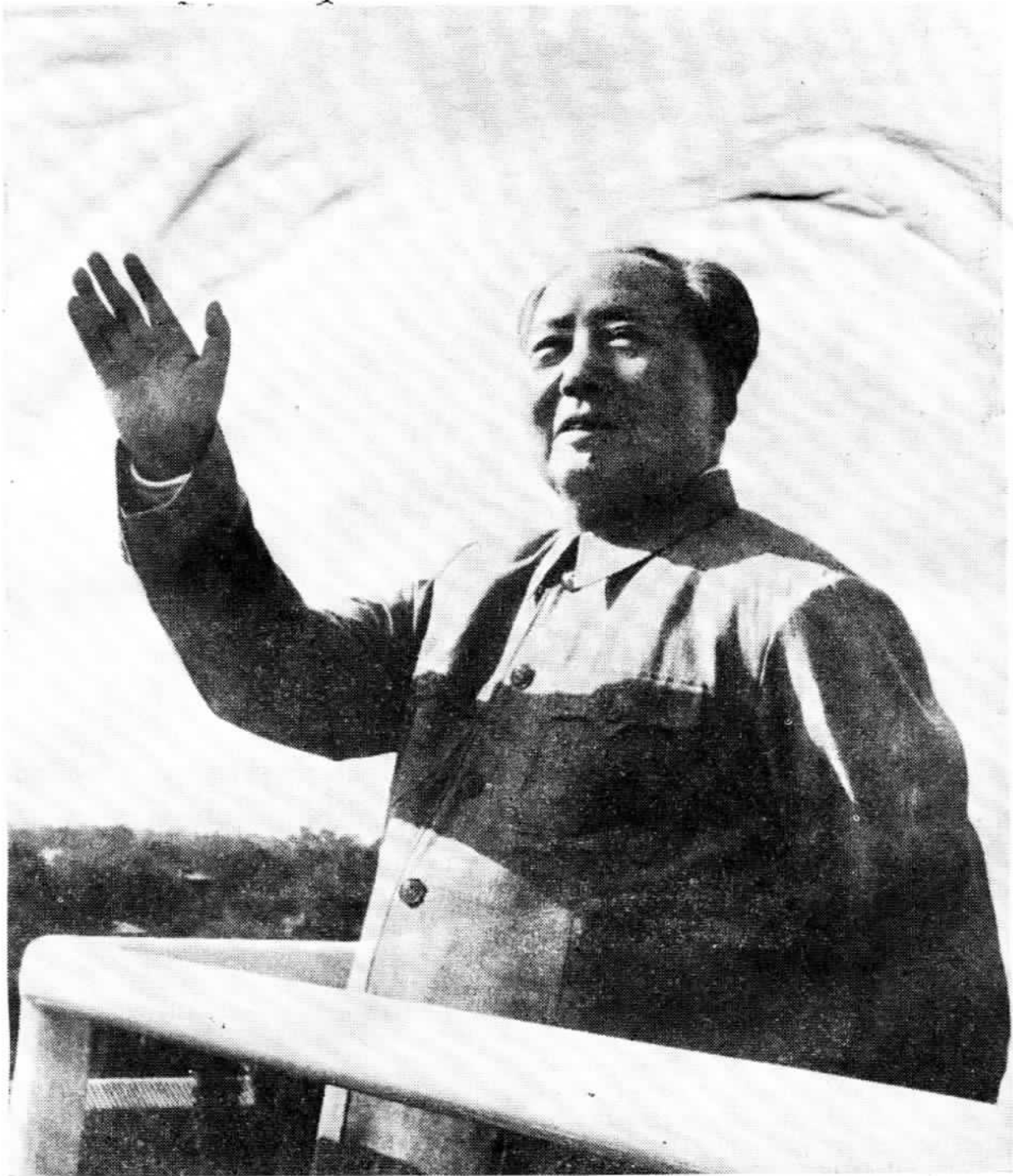
Chairman Mao Tse-tung

Our great teacher, great leader, great supreme commander and great helmsman