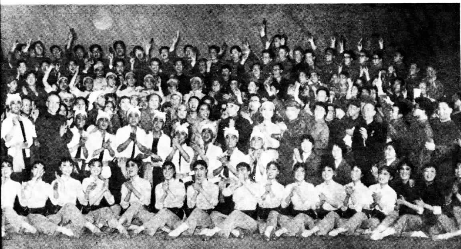
Mao, Vice-Chairman Lin Piao and others with the dancers of The White-Haired Girl ballet