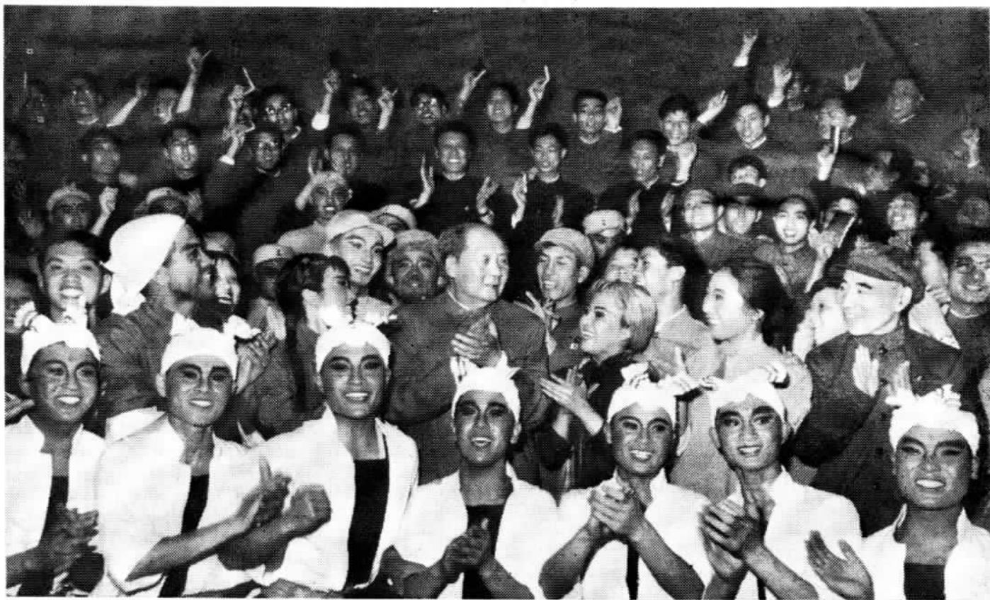
Chairman Mao, smiling, stands with Vice-Chairman Lin Piao and others for a picture with the dancers of The White-Haired Girl ballet