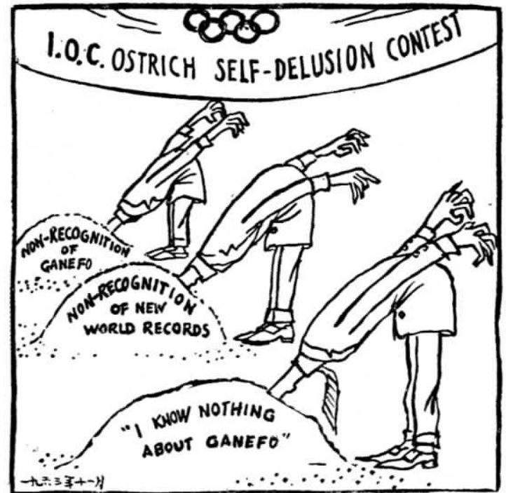
He Who Buries His Head Longest Wins Cartoon by Hua Chun-wu

600 exhibits provided by a number of participating countries. Included were sculptures, sports building models, graphic arts and embroidery. In addition, seven countries were represented at cultural performances in the Indonesian capital.