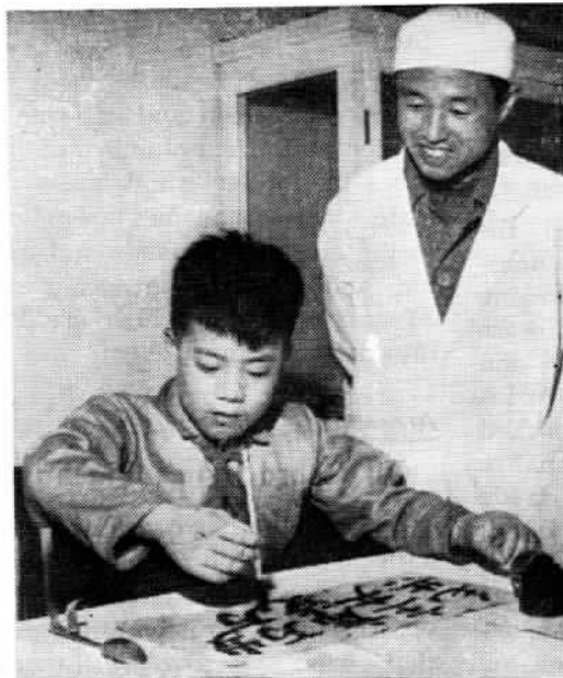
Writing with his new artificial hand