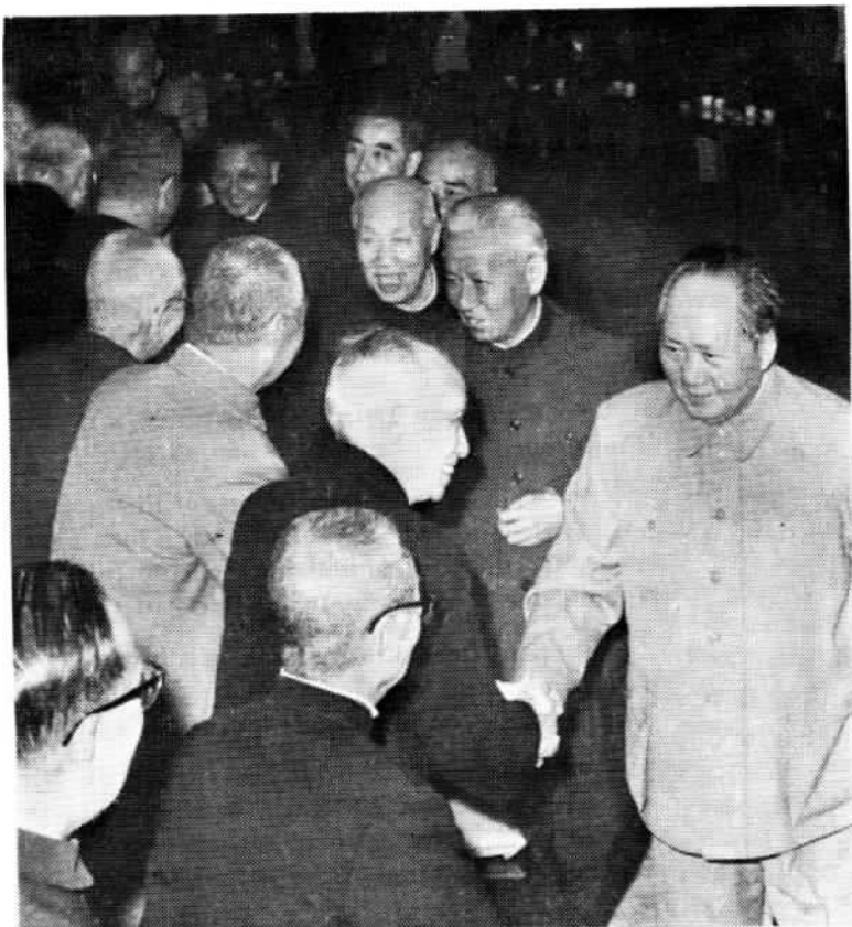
Chairman Mao Tse-tung, Chairman Liu Shao-chi and other leaders shaking hands with Deputies to the National People's Congress

Chairman Liu Shao-chi called a meeting of the Supreme State Conference which took place on November 15 and 16. One hundred and fifty-five people attended the meeting, including leaders of the state and of the Chinese Communist Party, leading members of democratic parties and people's organizations and personages prominent in various circles.