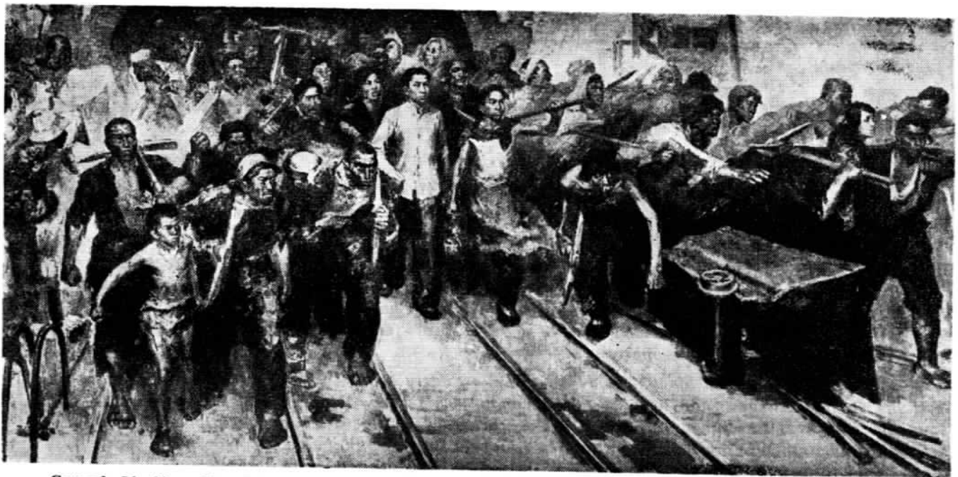
Comrade Liu Shao-chi and the Anyuan Miners