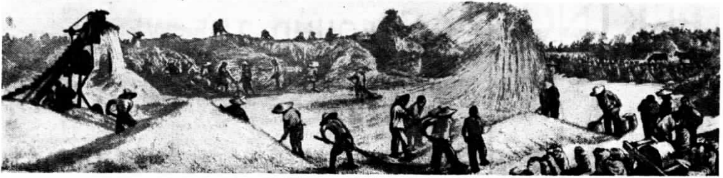
On the Threshing Floor