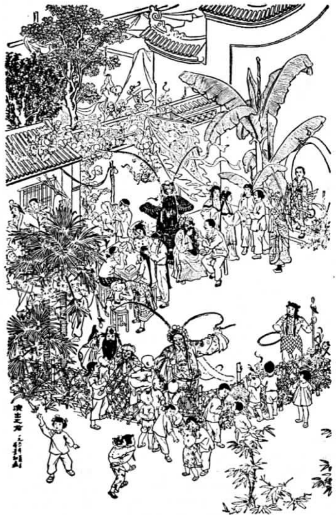
Before the Performance

When the Peking Team met the visitors two days later, they were able to win 4:1 by skilled use of two speedy wingers. Time and again these two tore down the length of the field before centring the ball to their inside-forwards to shoot. This tactic of using the two wingers to bypass the solid Vietnamese defence, especially heavy at the centre of the field, gave the home team a winning edge over the visitors.