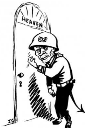
A veteran of the Saigon bottle-front knocks at the Pearly Gates

This sheds light on the peculiar popularity which a special kind of lounging jacket enjoys among G.I.s in Saigon. It bears such slogans and sentiments as "When I die I'll go to heaven because I've served my time in hell — Saigon 1961-62."