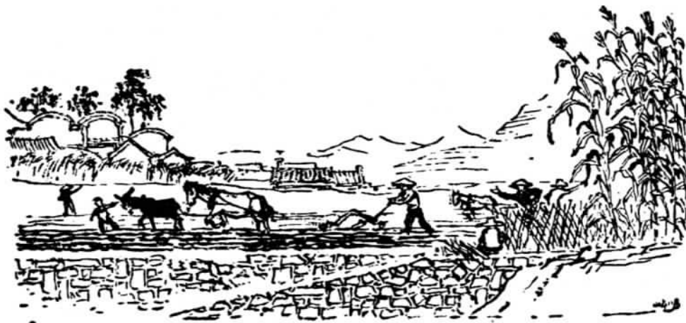
Autumn Sowing Begins

These Chekiang peasants have come a long way. Yet they are only pacesetters in a veritable mass movement of China's peasants to storm the gates