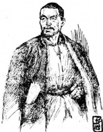
Kuo Chen-shan Drawings by Yu Hsueh-hsing

The contrast between Sheng-pao and the degenerating Kuo Chen-shan is