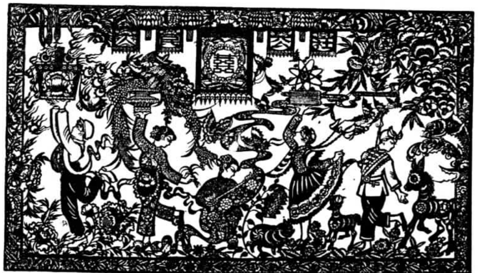
Celebrating the Harvest

Among the factors that will ensure the continued leap forward in 1960 are the promotion of a diversified economy with grain as the key link; the all-round development of animal husbandry with pig breeding as the central task; the energetic encouragement of technical innovations, capital construction on the farms and still more comprehensive implementation of the Eight-Point Charter for Agriculture; the further consolidation and development of the people's communes; continued all-out effort and a staunch fight against right deviation, firmly putting politics in command and the energetic launching of mass movements.