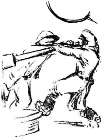
Oil derrick hands at Karamai Sketch by Jack Chen

More Oil from Karamai. Karamai, in the Sinkiang Uighur Autonomous Region, overfulfilled the state plan in all respects by December 16—in crude oil production, well drilling, oil testing, in capital construction and total output value. The amount of crude oil output, to cite one concrete example, was three times the total of 1958. The Karamai Oilfield was located and mapped out for production four years ago by the combined efforts of Chinese geological prospectors and Soviet experts. Since then a wilderness has been turned into a thriving town, one of the four major oil-producing centres of the country. With much of the surveying work completed, this year the Karamai Oilfield has shifted its emphasis from prospecting to actual