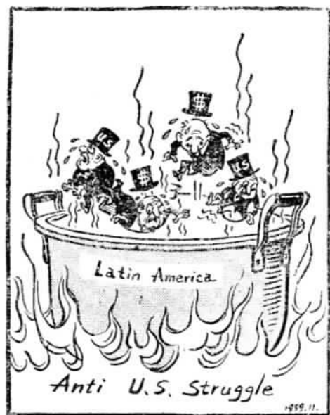
Something cooking By Cheng Wen-chung

Now an armed struggle of the Paraguayan people against the dictatorship