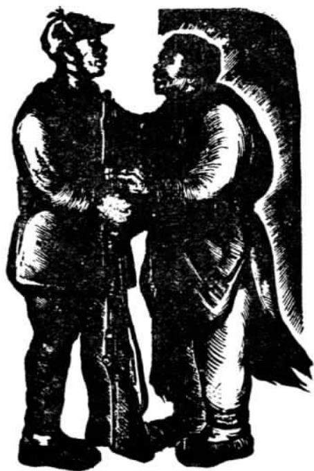
Comrades! A woodcut of 1942 by Lu Mang

The Peking School of Dancing has scored another hit with its production of the full-length Chinese ballet Maid of the Sea . In the few years since its founding, it has successfully produced three Western classical ballets— La Jeune Fille Mal Gardée , Swan Lake and The Corsair . But the latest addition to its repertoire is in a completely different vein. It is the first Chinese ballet that is based mainly on classical Chinese and folk dances while drawing on the Western ballet and Eastern dances. What makes it all the more significant is the fact that