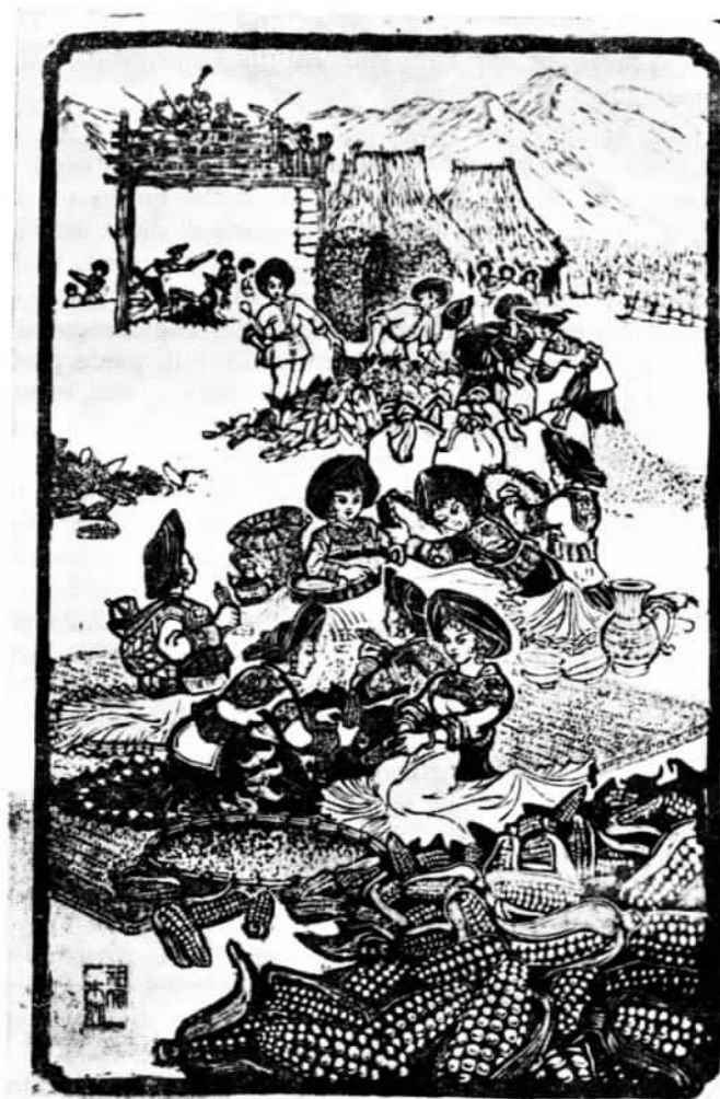
The Lisu people harvest