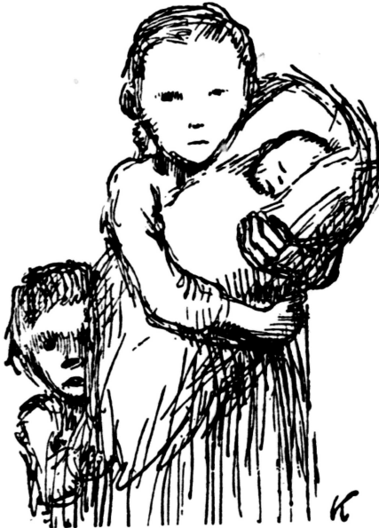
While Pa and Ma slave in the mill, this little workers' child must be mother to her kid sister and brother.

Children from 10 up have to work in the mills to support their family. The bosses have more children than grown