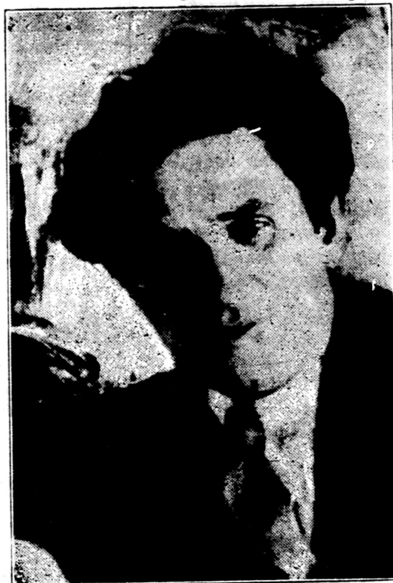
Gregory Zinoviev, Chairman of the Third International, which unites all the revolutionary workers of the world.