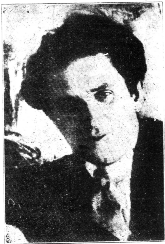
Gregory Zinoviev, Chairman of the Third International, which unites all the revolutionary workers of the world.