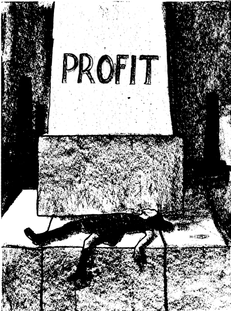
The Workers' Child on the Altar of Profit.

And yet, in this wonderful country you hear and see about, there are millions of little children who are SLAVES! These are the workers' children — not the capitalists. These are the children who have to go to work in factories and mines and mills and fields and in the streets where they sell papers or shine shoes.