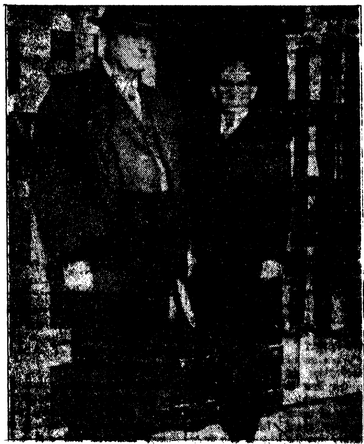
Informed observers believe "No." Tom Mooney (above) photographed on the day he was incarcerated in San Quentin.

The court in high-handed fashion successfully resisted all efforts of Mooney's counsel to bring him to court to be present at the preliminary of his habeas corpus plea.