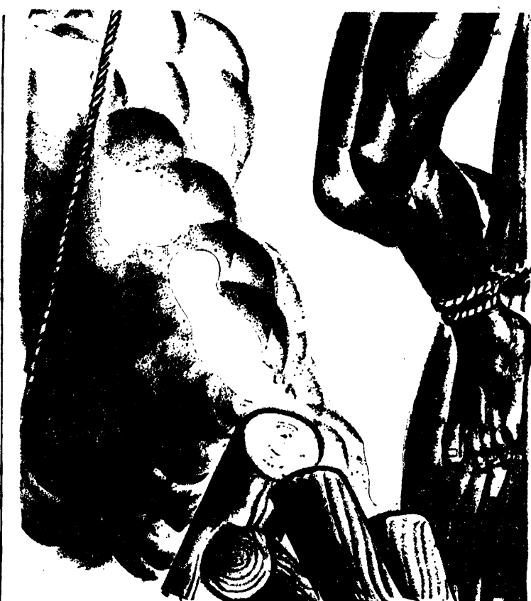
LABOR IN A BLACK SKIN

of the North, largely disinterested in this unseen struggle of exploiters, resisted the war with all their might. The soldiers' draft laws were marked by a river of blood in every corner of the land. In New York in a single draft riot between 600 and 1200 people were killed. The battle lasted five days. Fifty buildings were burned. Troops fired into the crowds with shells from batteries. It was the last blind struggle of the individualist American against the coming class groupings under powerful monopoly capitalism, a society of which he did not dream.