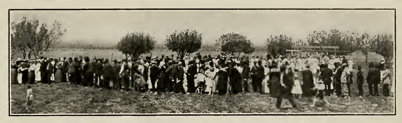
Part of the May Day crowd in line before the serving stands in the orchard. Over 1000 people were present.

must be delivered to the cars in a finished state. It has taken time, energy and money to transport material across those yards three times when once would have been much better, had the machinery been laid out in the proper order.