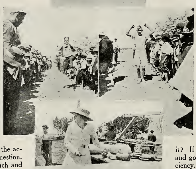
Athletics formed one of the chief attactions on May Day. Below is one of the serivng stands.

At every step he has aimed to take the best, easiest and quickest way, but the chances are strong that he took the easiest and quickest way, and gave little thought about whether it was the best ultimately. Finally he realizes that something is wrong. He is not getting the results, so he analyses the situation and he may find something like this: His raw material is delivered on one side of the plant while the first process takes place on the other side. The processes carry the material from one detached building to another till the last process finds it at a point clear across the yard from where it