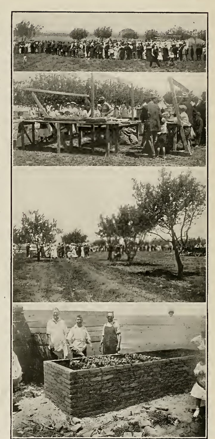
Scenes at the barbecue on May Day, showing diners lining up at the serving stands; bottom, barbecuing the meat.

There's a description of the May Day events and, after glancing at it, I find it totally inadequate to express just exactly what was put into the day. While we all enjoyed the parade. the athletics, the addresses, the barbecue, the dance, yet there is something more about the whole affair that is clear out of reach. I can't express it. No use of me trying, and I don't believe any one else can do full justice to the day. There's a something about May Day that feels like a Fourth of July, a Thanksgiving and a Christmas. The dearth and chill sometimes here and there, a sadness of joys and sorrows experienced, and hopes and resolutions for the future of New Years, are all combined in this day. When looking at the track events, it is not merely a competitor we see; it is not the paraders in the march we see when we see the winding cortege. It's something else. It's the spirit that we feel, the something intangible that weaves the universe about and binds human