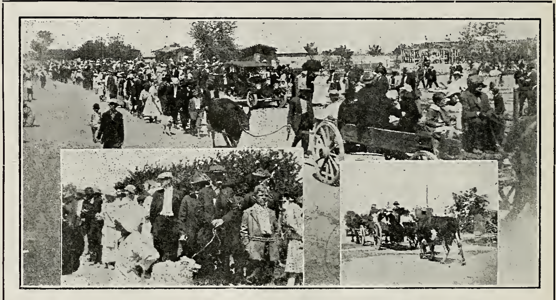
May Day Parade of the first comers to Llano, with inserts showing two groups of the early colonists of 1914-15.

I received all the literature you sent to me, and, after reading almost every word with great interest, I was very much pleased with the splendid progress that is being made by the Llano colonists. It is indeed inspiring to know that in a short time such progress has been made towards the great ideal and principles upon which our future civilization must be shaped. In order to show the extent of my interest in the Llano Colony, I inclose