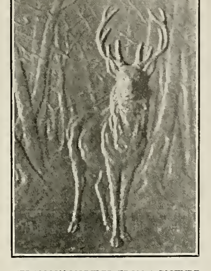
MEDALLION MODELED FROM A PICTURE. Many of the objects on display have been modeled from prints or photos when suitable originals are not easily obtainable. The deer shown here is an example of this work.

Special material on Child Labor in your State will be sent on request to the National Child Labor Committee, 105 East 22nd Street, New York City.