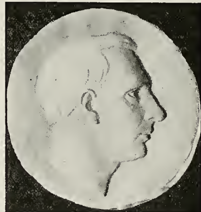
MEDALLIONS OF LLANO CITIZENS are shown on various pages of this issue. Those shown here are regarded as exceptionally good likenesses and would be creditable to any studio or to any artist.

Therefore it is highly essential that it be a natural or characteristic expression.