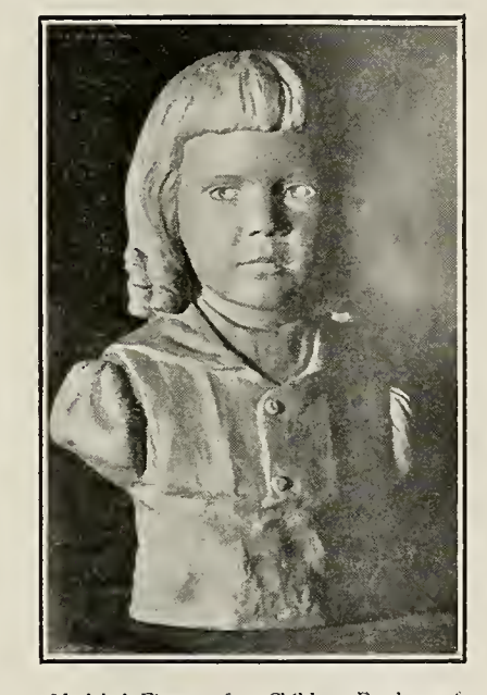
Modeled Figure of a Child, a Product of the Llano Art Studio.

When the wave subsides the foundations of the building will have to be erected anew. The confidence of man in man has had a rude blow. The reaction towards violence is sending currents through many hidden and open channels. And yet the recognition of the law of mutual help and mutual confidence has been demonstrated to the minds and consciences of men, not as a vision or a hope, but with all the force that