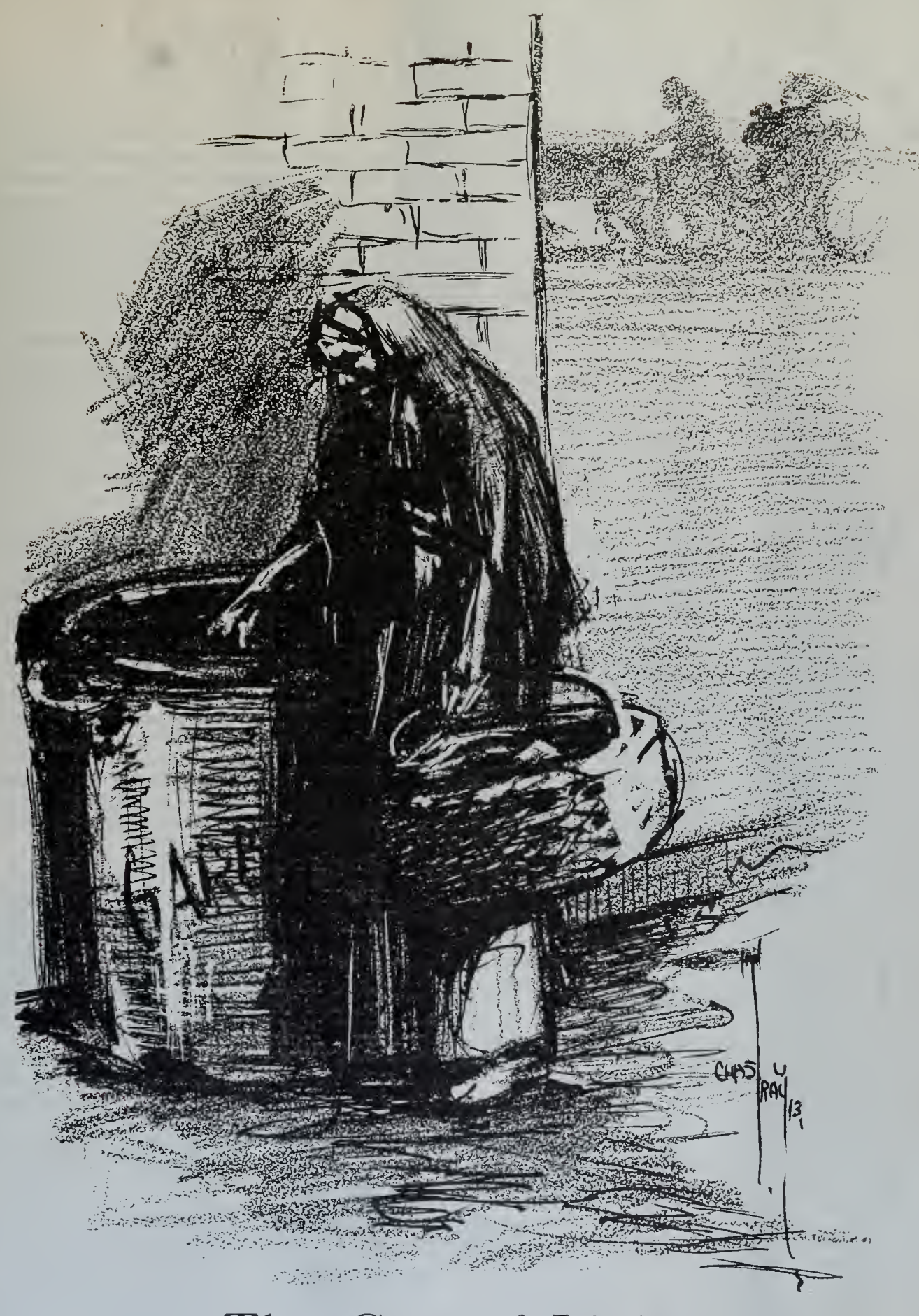
The Cost of Living