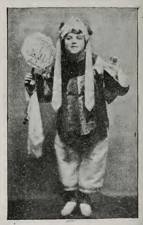
"TSO." A Dainty Character in "The Yellow Jacket."

The expected promotions and heroism are rapidly coming to the hero when he begins to see war as it