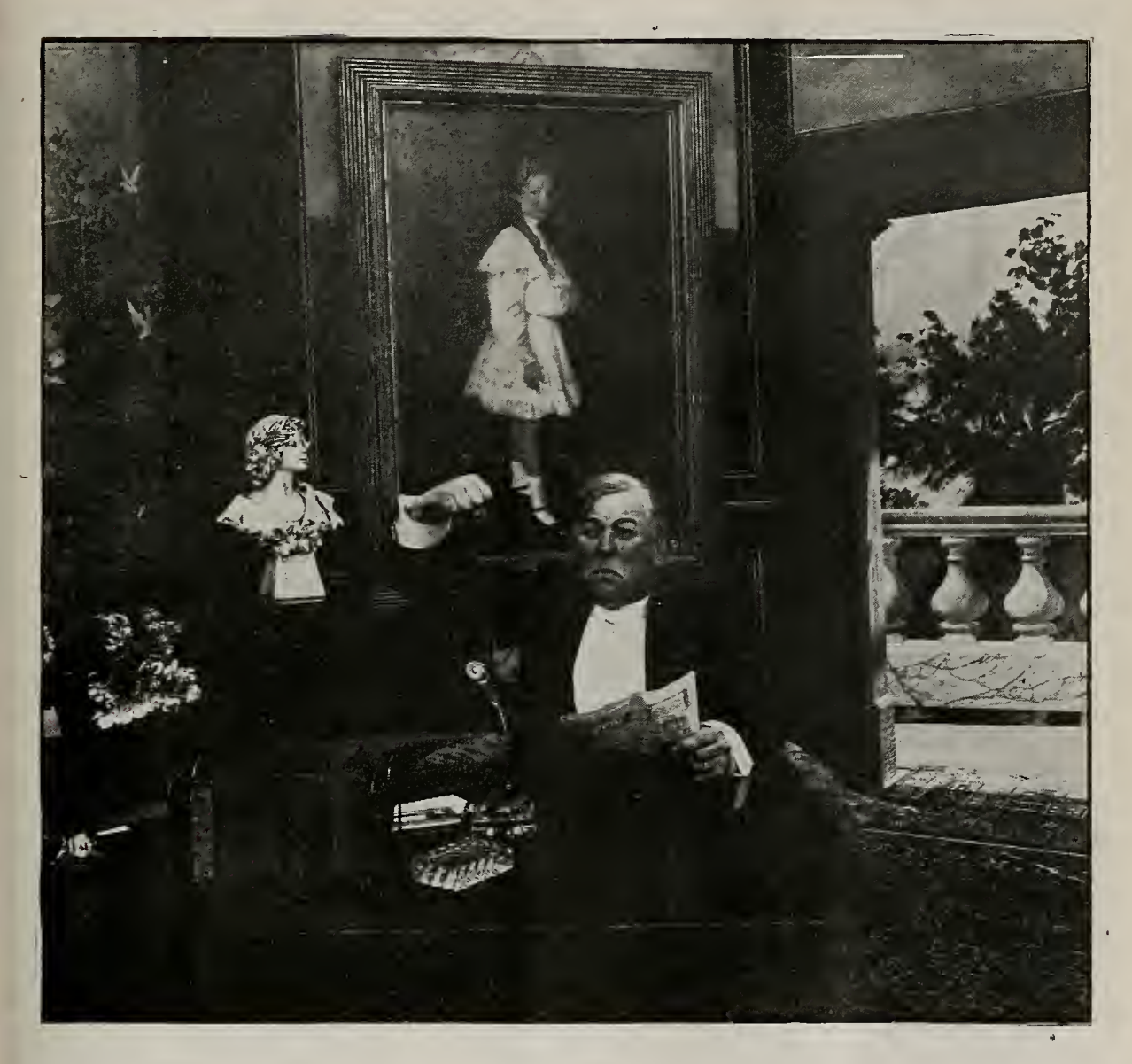
"What! Girls in my employ want more than four dollars a week? I won't give them another d____d cent!"