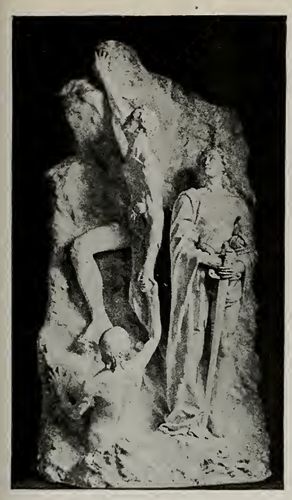
"THE TWO AMBITIONS."

"The Worker" is a powerful and suggestive creation. It is a figure that commands respect and to us represents the ideal worker-strong and masterful and with a mind that can think. In referring to this work Mr. Stone has written the following descriptive lines: