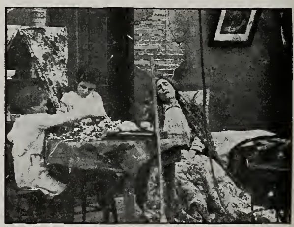
BELOW THE BREAD LINE

"Everybody melt out on the conversation stuff till his Grace gives the answer to this puzzle," shouted a scalded iron molder whose naked torso and splendid