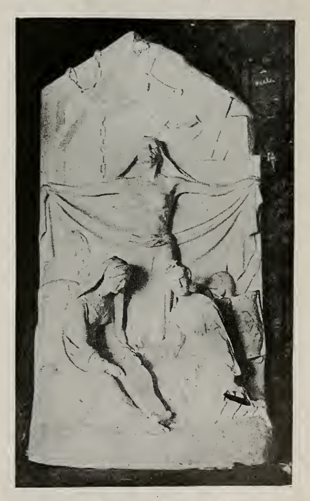
"THE AGONY OF THE AGES."

"The concentration or introspection depicted in the pose of 'Knowledge,' who, bending over her scroll, (Continued on next page.)