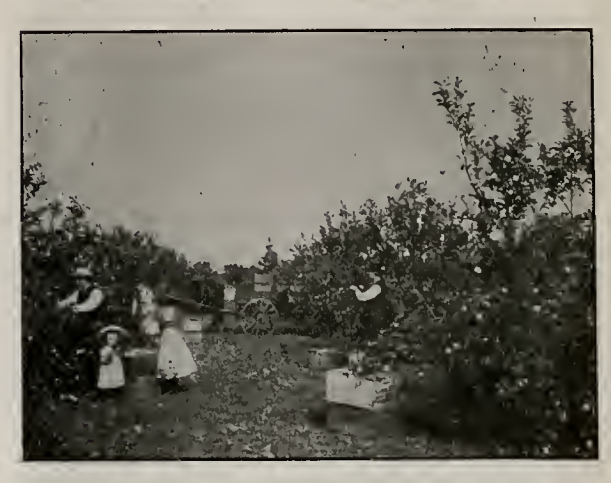
"Great stretches of valley in citrus fruits"

The entire state developed as landscape architects will plan with regard only to the perfecting of it all.