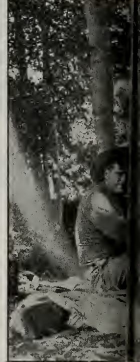
Enjoying the bestient

"While I was in college," London says, "I went to a circus in Oakland one night. I lingered after the show and by a bonfire I came upon a bunch of small