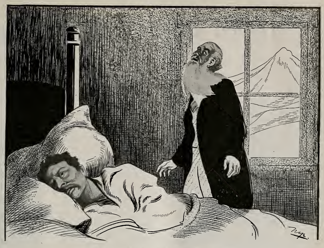
"There is but one eye capable of scanning your past."

crimes you have committed. They are now beyond you and me.