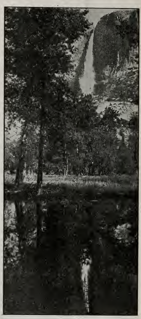
Yosemite Falls "Volume of white water plunges 2,600 feet—half a mile."

three of the world's best harbors and is traversed by three extensive mountain ranges: the Sierra Nevada, Sierra Madre and Coast ranges. Mountain, mesa, plain,