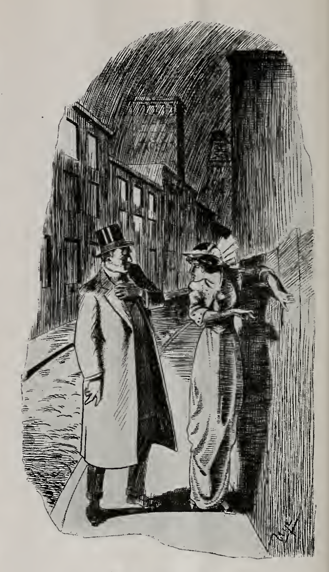
"Stop!" she shrieked.

and plunging his hand into his pocket, he brought up with it a gold coin and held it forth to her. She glanced at it, grabbed it and hissed again.