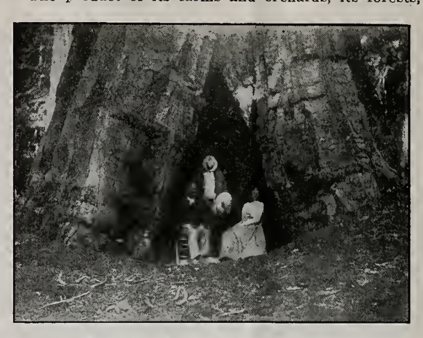
Sequoia Giant of Mariposa Group

The product of its farms and orchards, its forests,