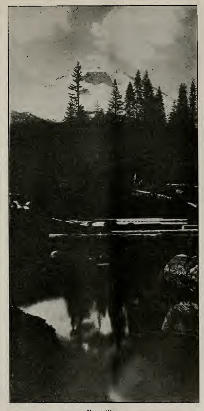
Mount Shasta "Like a hoary sentinel o'ertops surrounding country at an altitude of 14,350 feet. See page 79.