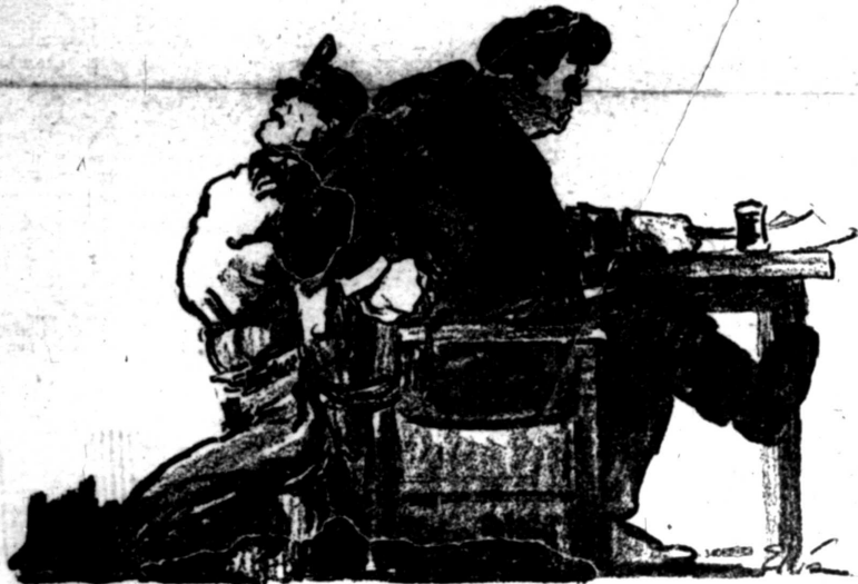
Lewis' Job—Holding Them For The Bosses.

If Lewis means that the Communists everywhere are ready to stand