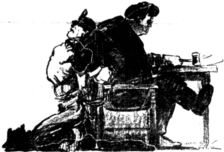
Lewis' Job—Holding Them For The Bosses.