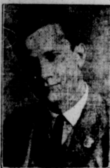
JAMES P. CANNON Who Will Speak at the May 1st Mass Meeting in Ashland Auditorium.