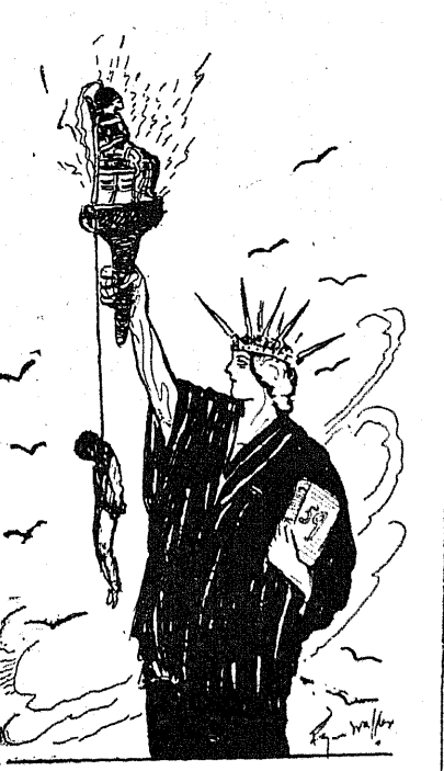
DO YOU GET A BUNDLE!