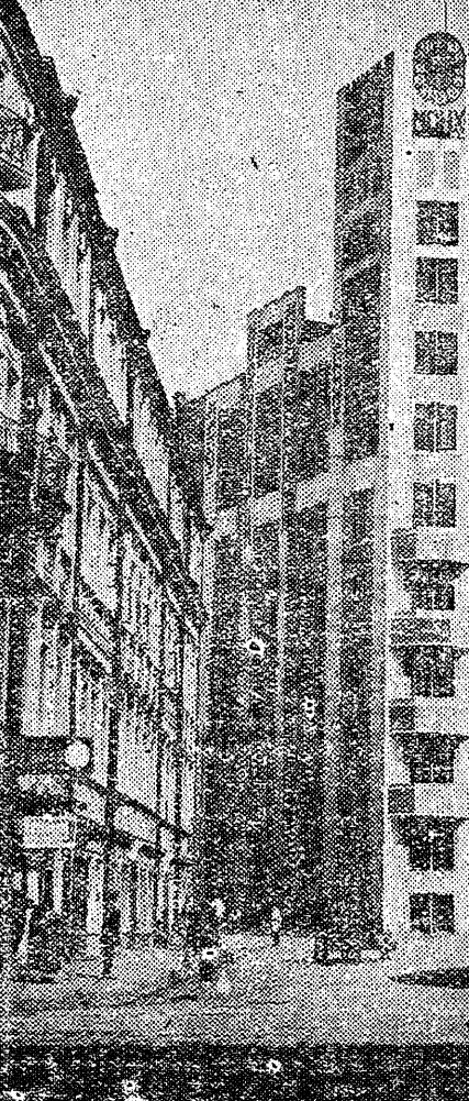
"Mosselprom," one of the many spacious, sanitary and therefore, healthful factories of the Soviet Union. This building is located in the heart of the city of Moscow. Note the many windows that shed light to every part of the building and compare it to the sordid, dark, miserable factories where workers slave from eight to twelve hours a day in the United States. All workers in the Soviet factory pictured above work seven hours a day, and a five-day week. The factory above make cigarettes and confectionary.