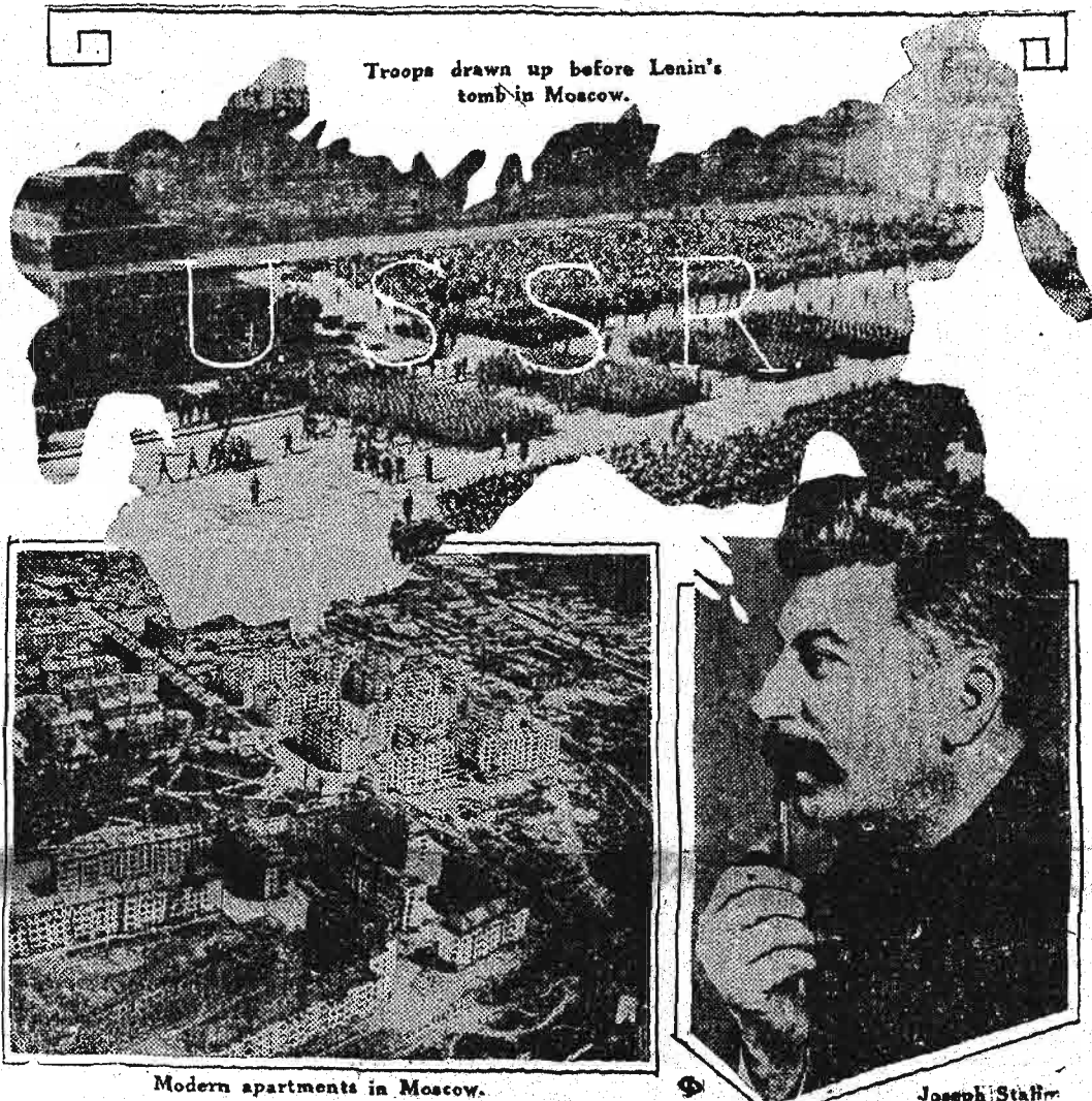
Troops drawn up before Lenin's tomb in Moscow.

Workers everywhere should fight for recognition by the United States government of the government of the Soviet Union.