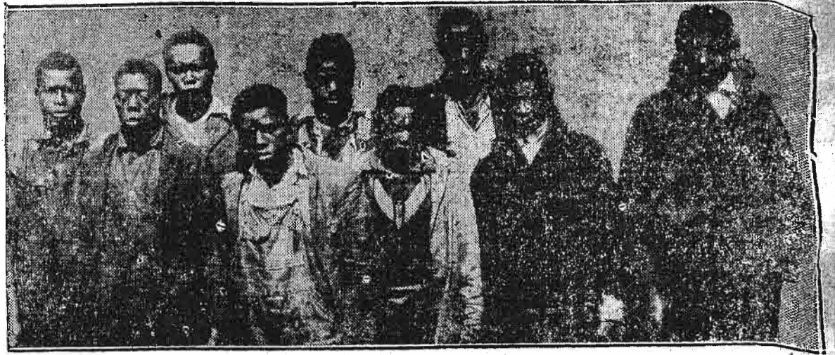
The nine boys are, left to right: Andy Wright, 19; his brother, Roy Wright, 14; Hayood Patterson, 17; Eugene Williams, 14; Willie Robinson, 17; Olen Montgomery, 17; Clarence Morris, 19; Charlie Weems, 20, and Olen Powell, 16.

These are the nine Scottsboro boys through whose tortured bodies the Alabama boss class hopes to shoot chained lightning. These boys are all innocent. But the bosses are growing more desperate as the movement toward unity of action between the white and Negro workers grows. The bosses are still trembling at the discovery that the croppers are organizing to fight against slavery. They are becoming rabid as they realize that the croppers' union at Camp Hill, which they tried to smash with blood and fire still lives. The bosses know that there are new Camp Hills that have grown since their murder drive. They know tomorrow there will be still more. They see the first steps toward a movement that must culminate in the agrarian revolution in the South. They know that the slogan of self-determination for the Negro national minority (which is a majority in 92 contiguous counties of the Black Belt) is striking deep root wherever it reaches, and that it is reaching farther and farther into the densest South.