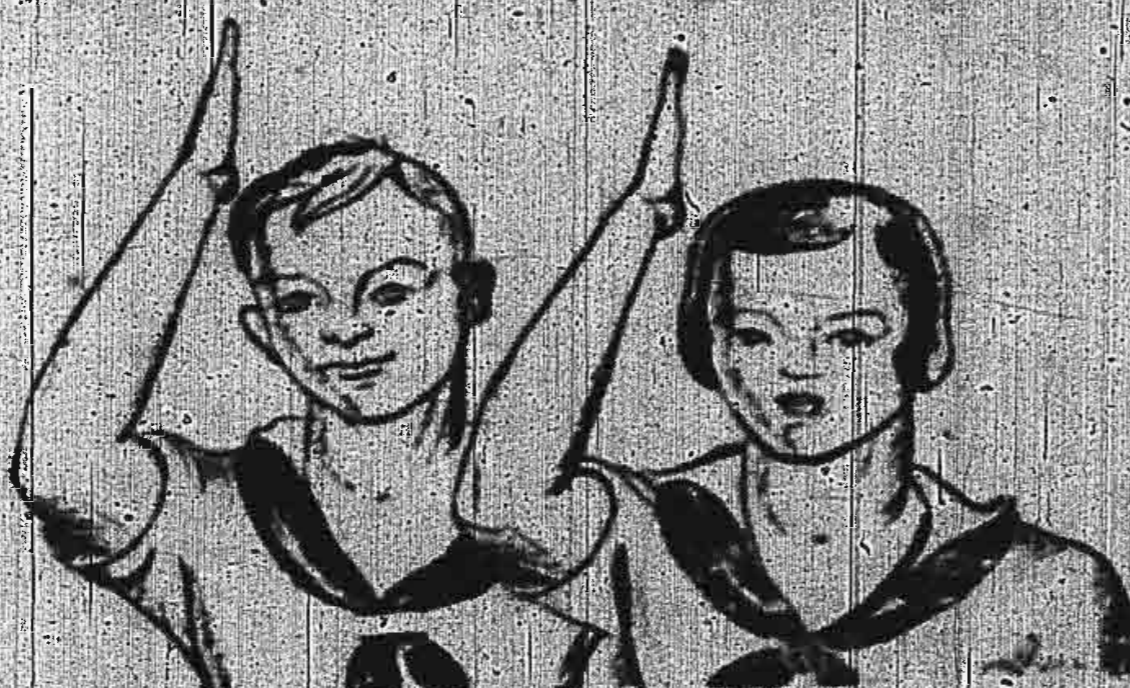
Children of workers, white and Negro, are joining the Young Pioneers, a workers' organization for children. Charlotte already has 75 members. How about Chattanooga?