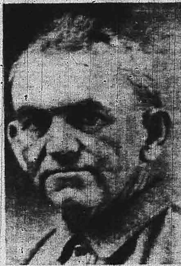
Tom Mooney, framed labor leader, has already served 14 years in jail. Only a wide protest movement will obtain his release.