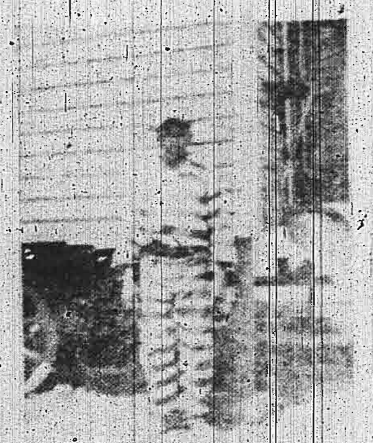
The specialty of the courts ruling class—changing! Brutal and forced labor is described in the article below.