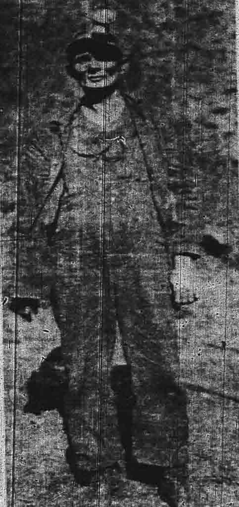
An Alabama miner. Miners throughout the country are ready for a bitter struggle against starvation.