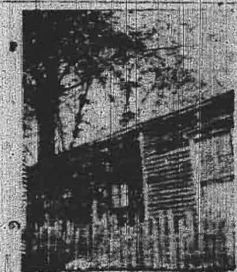
Home of Haywood Patterson in Chattanooga.