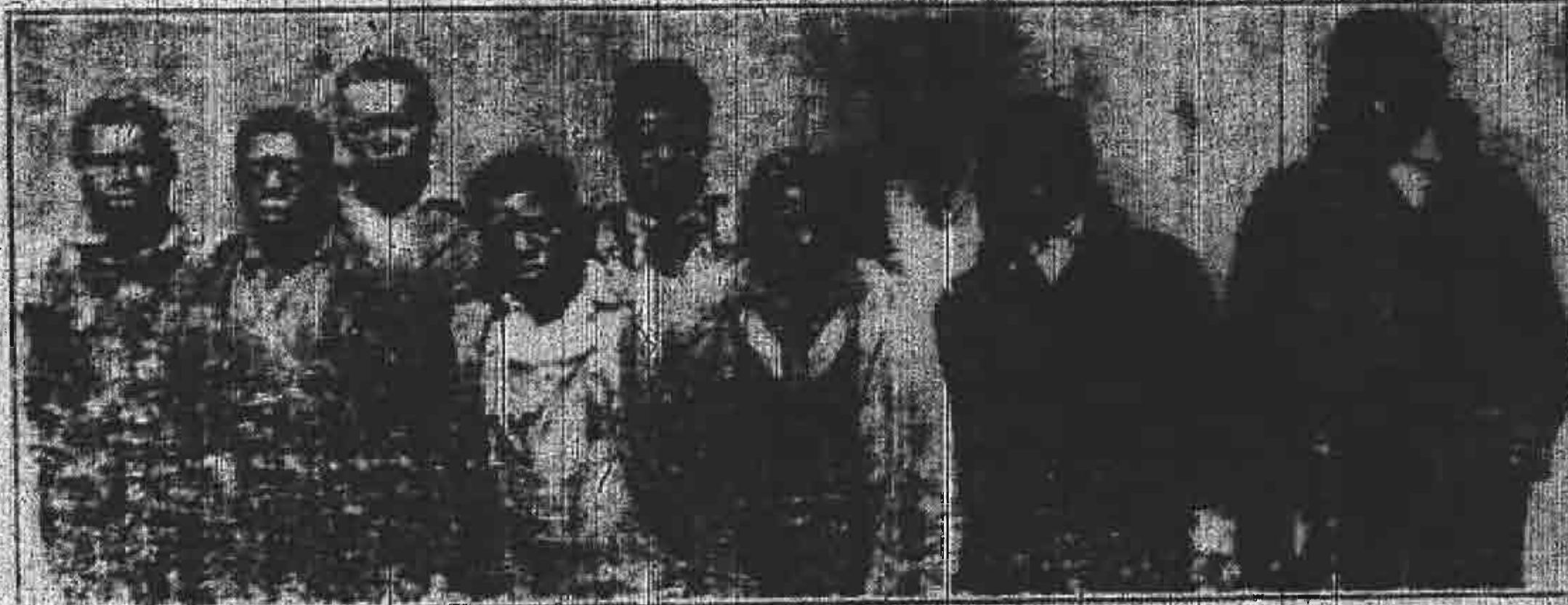
Left to right: Andy Wright, 15; his brother, Ray Wright, 14; Haywood Patterson, 17; Eugene Williams, 14; Willie Robinson, 17; Olen Montgomery, 17; Clarence Norris, 19; Charlie Weems, 20; and Gize Powell, 16.