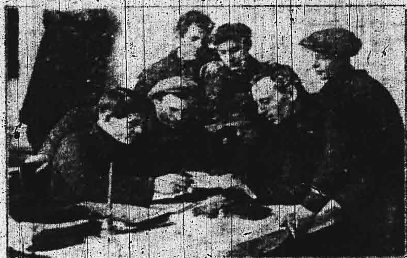
A workers management committee in a Soviet factory. In the Soviet Union the workers themselves manage the factories, see to it that the 5-year Plan is successful. Here there is no unemployment—instead 2,000,000 more workers are needed. In the U. S. there are 10,000,000 unemployed and wage-cut after wage-cut.