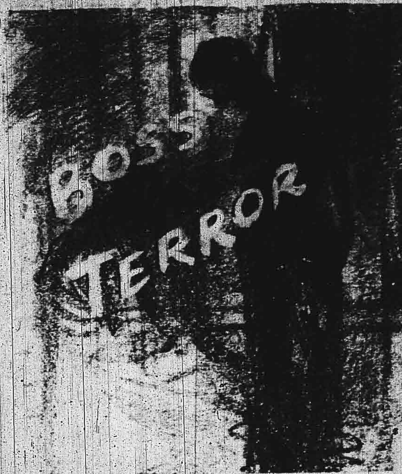
The boss threat against all those who refuse to struggle. As conditions grow worse, the terror increases. Stop this by white and colored organizing together!