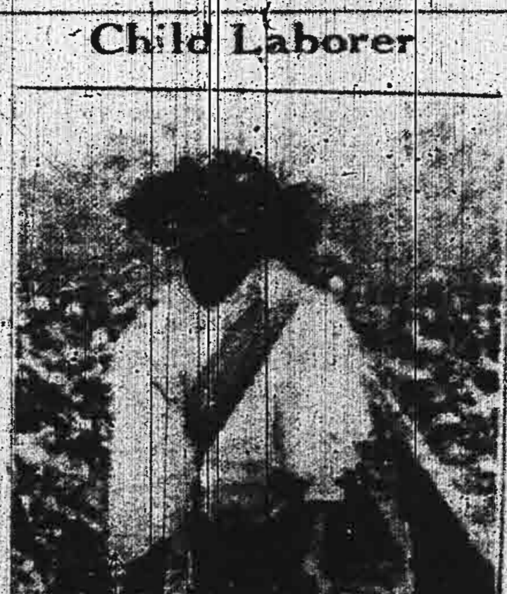
Child Laborer When cotton picking comes this year, will be worse than last. Farm workers must begin to organize fight now to carry on the fight on big plantations against further wage-cuts.