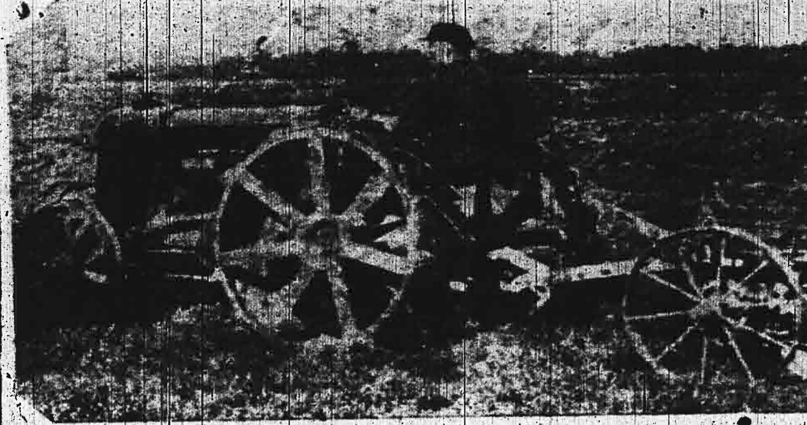
Above is a Soviet farmer on a new collective farm, using the latest machinery to produce crops. Not only is there no unemployment in the Soviet Union, but there is a shortage of 2,000,000 workers. The life of the worker and farmer in the Soviet Union is the freest and most secure of all.