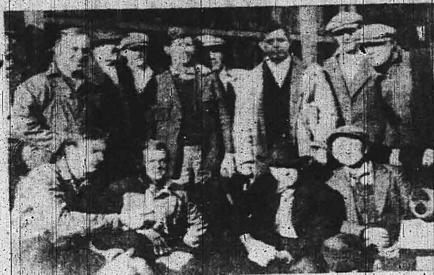
A group of West Virginia miners evicted from company-owned homes during strike. Jobless miners in Alabama, Tennessee and Virginia are now fighting against evictions.