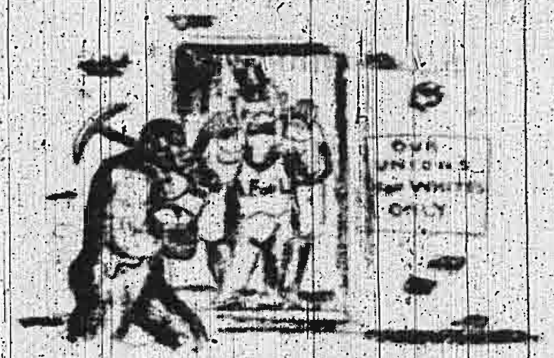
March Past the Fakers and into the T. U. U. L.!

About 5,000 workers, two-thirds of them Negroes, had gathered on the overhead bridge job on Monday morning when the work was scheduled to begin. The boss began going thru the crowd picking out old stand-bys who would work cheap and hard. This made the rest of the Negro and white workers mad and they crowded