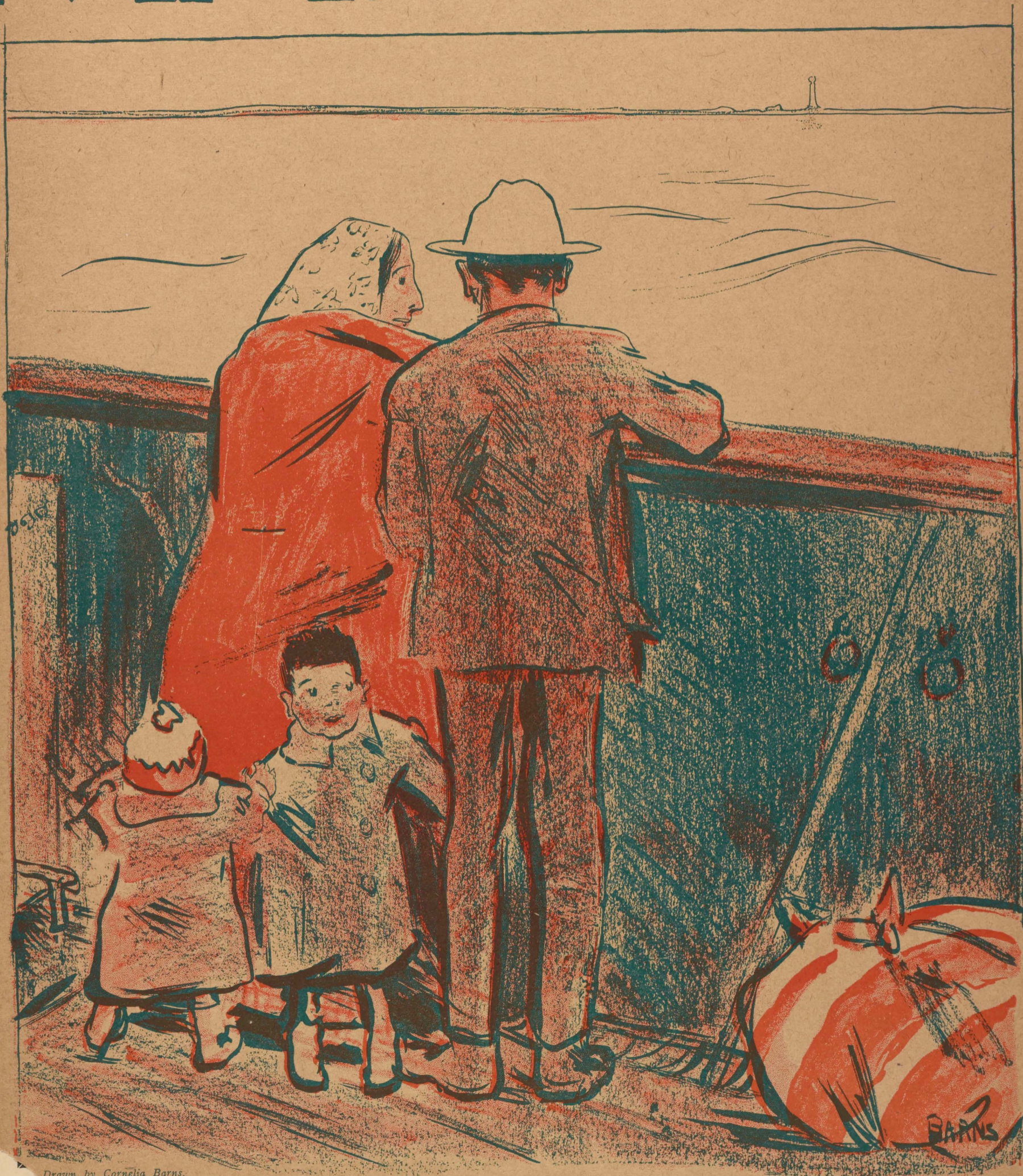
Drawn by Cornelia Barns.