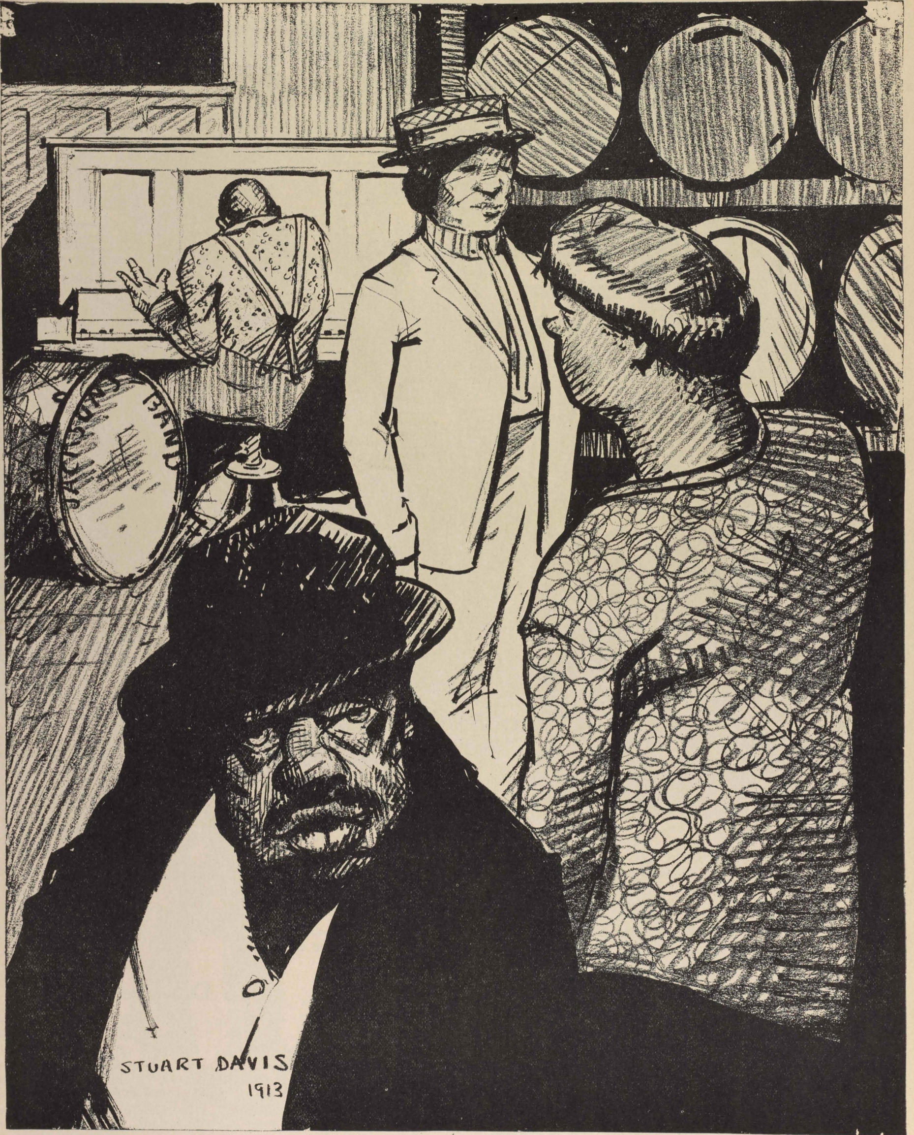
Drawn by Stuart Davis.

"LIFE'S DONE BEEN GETTIN' MONOTONOUS SINCE DEY BU'NED DOWN OU'AH CHURCHII."