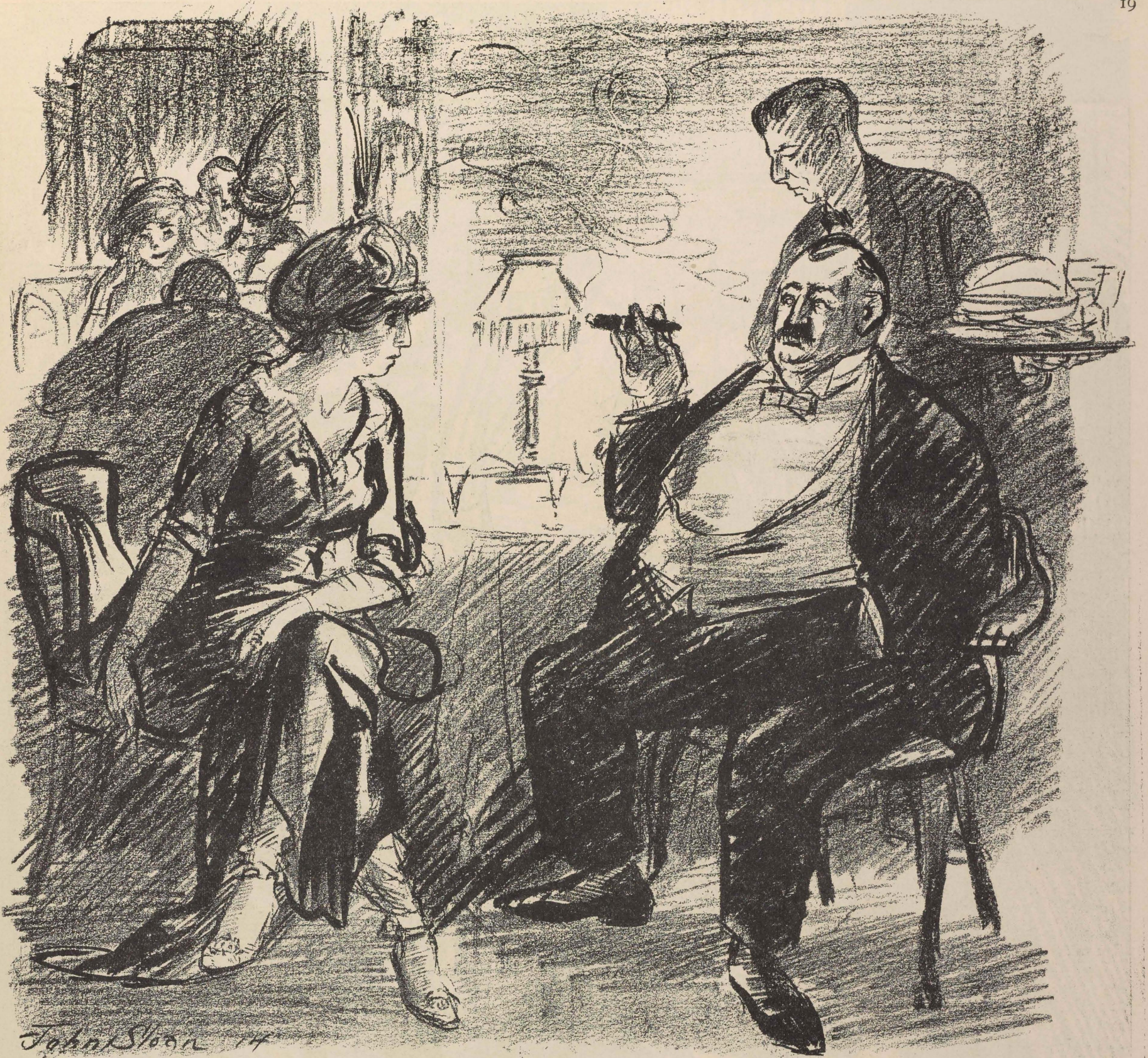
Drawn by John Sloan.