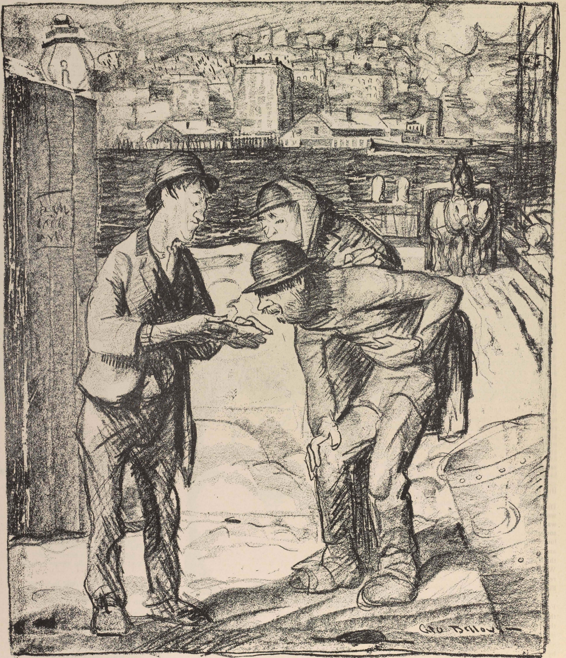
Drawn by George Bellows.