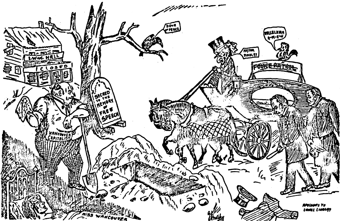
VANCOUVER'S DREAM—A RUDE AWAKENING AT HAND!