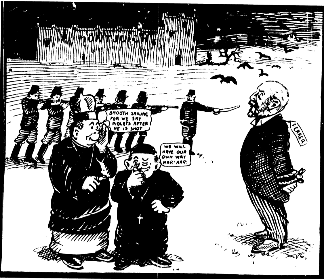
"LONG LIVE THE MODERN SCHOOL" (Last Words of Professor Ferrer.)

Are you boosting the Worker all the time? Keep pounding away so that we can soon get our own printing plant.