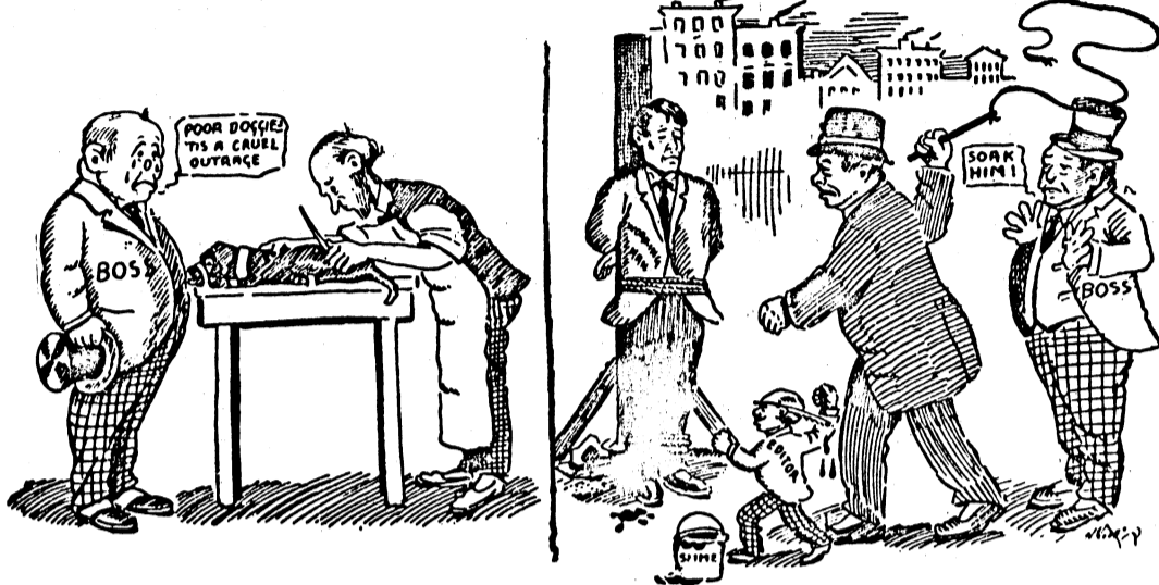
"SYMPATHY" FOR PUPS—WHIPPING POST FOR THE WORKERS

Back numbers of the Industrial Worker can be obtained for 25 cents per hundred, assorted numbers. Make good advertising material for the workers. Limited number. So order soon, before they are gone.