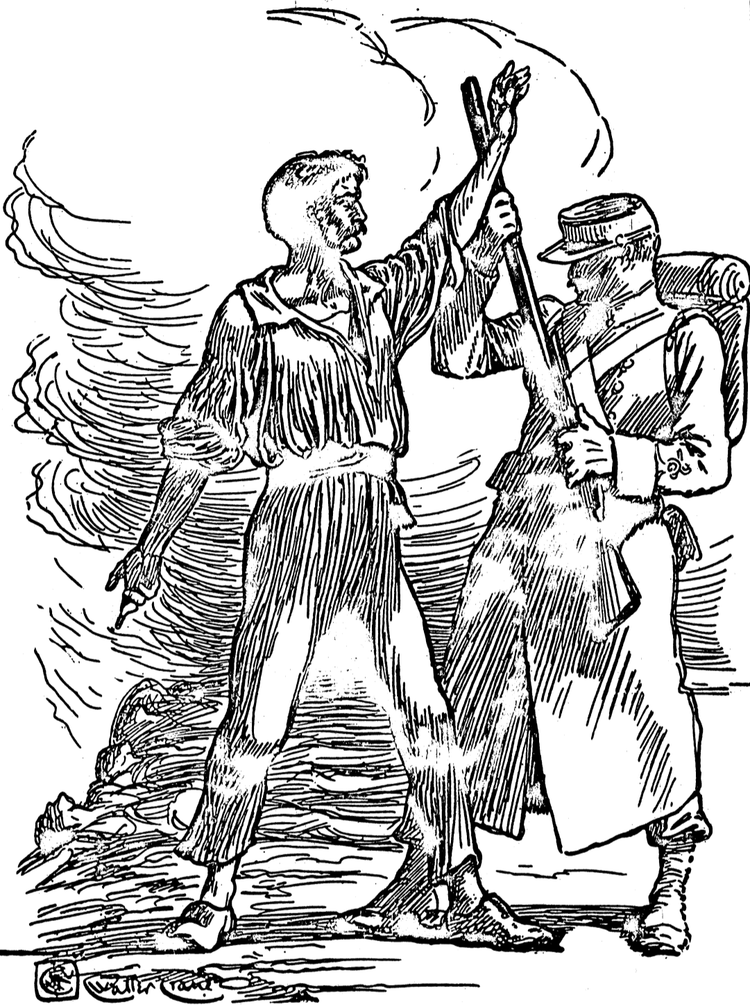
(From Le Temps Nouveau, by Walter Crane)