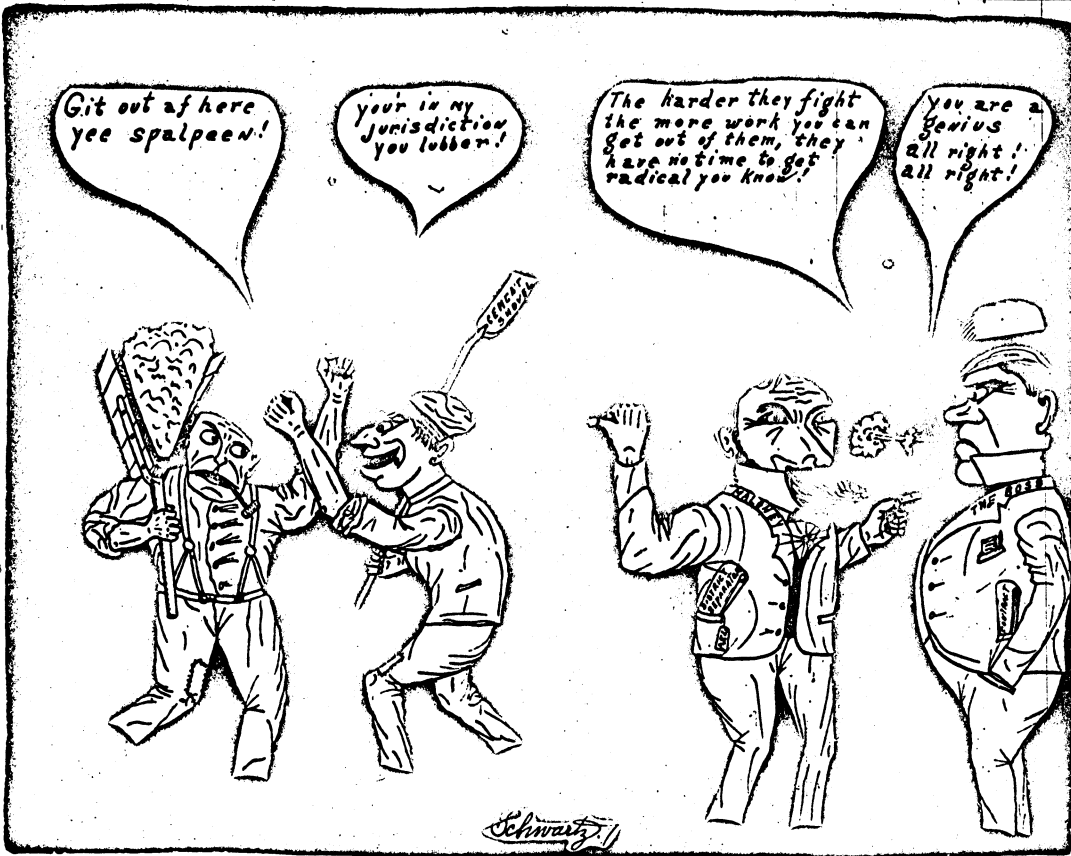
Brothers (!)—Hod Carriers Get $3.50. Cement Workers Take Job For $3.00—A. F. of L.